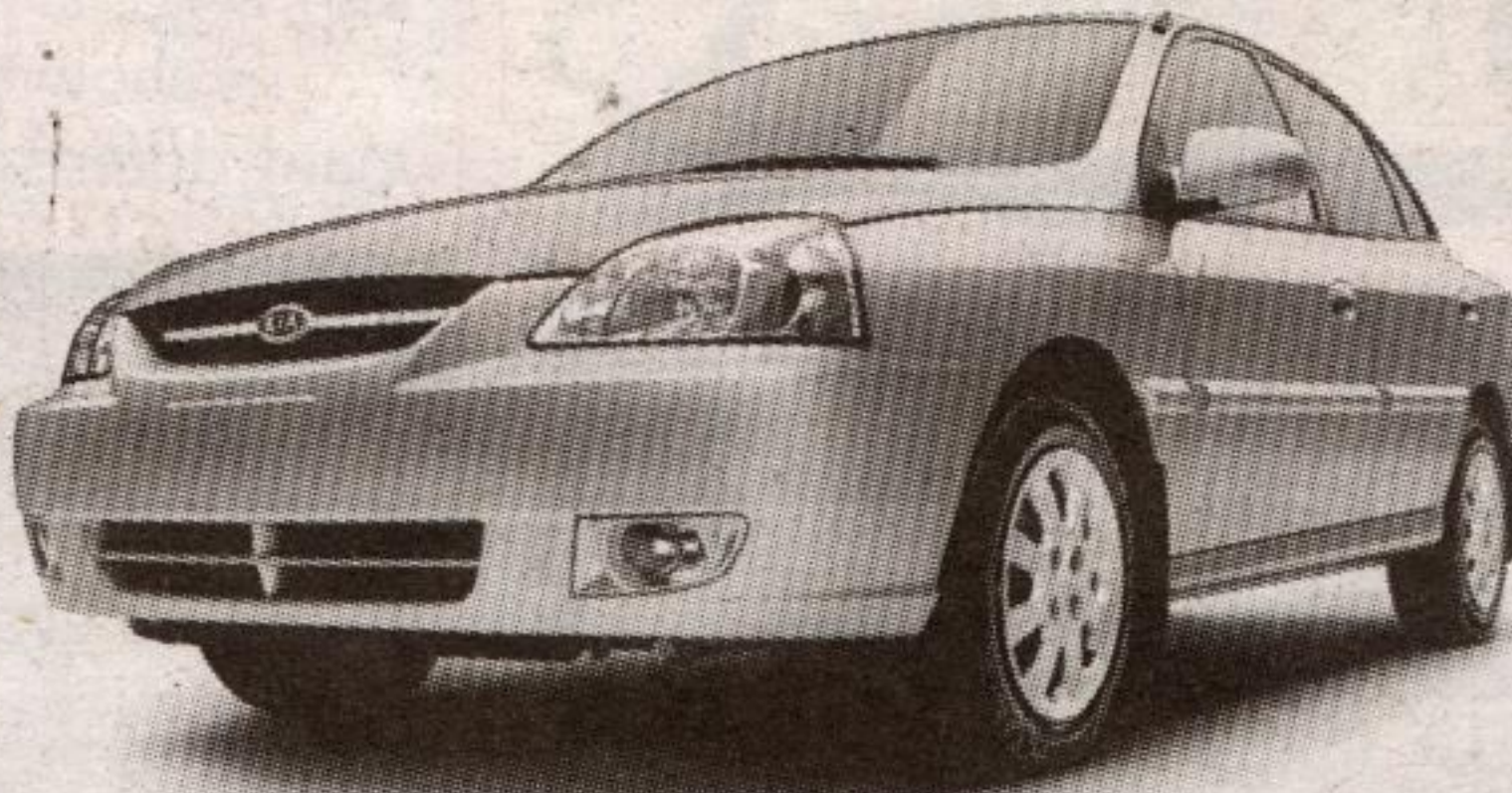
LS model shown 1