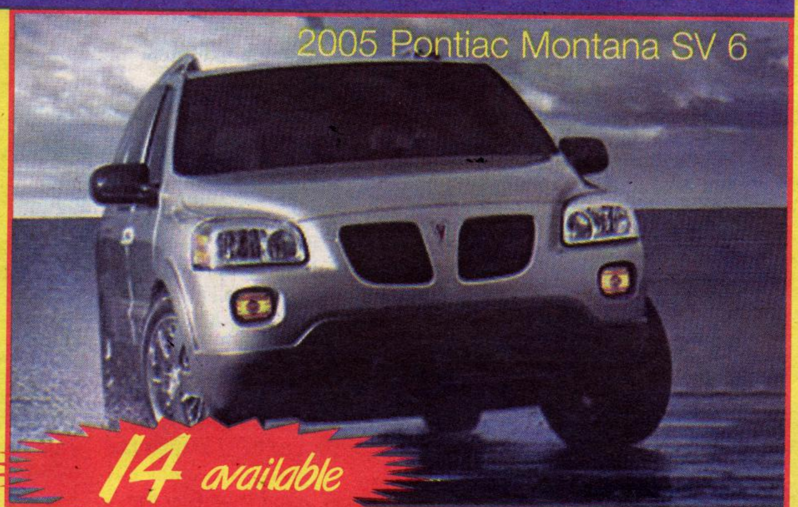
2005 Pontiac Montana SV 6