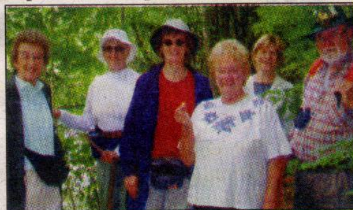
ACTON SENIORS HIKING CLUB

• The Acton Seniors Hiking Club believe hiking the trails of our beautiful and scenic Halton Hills is a wonderful and invigorating experience and provides, excellent health benefits.