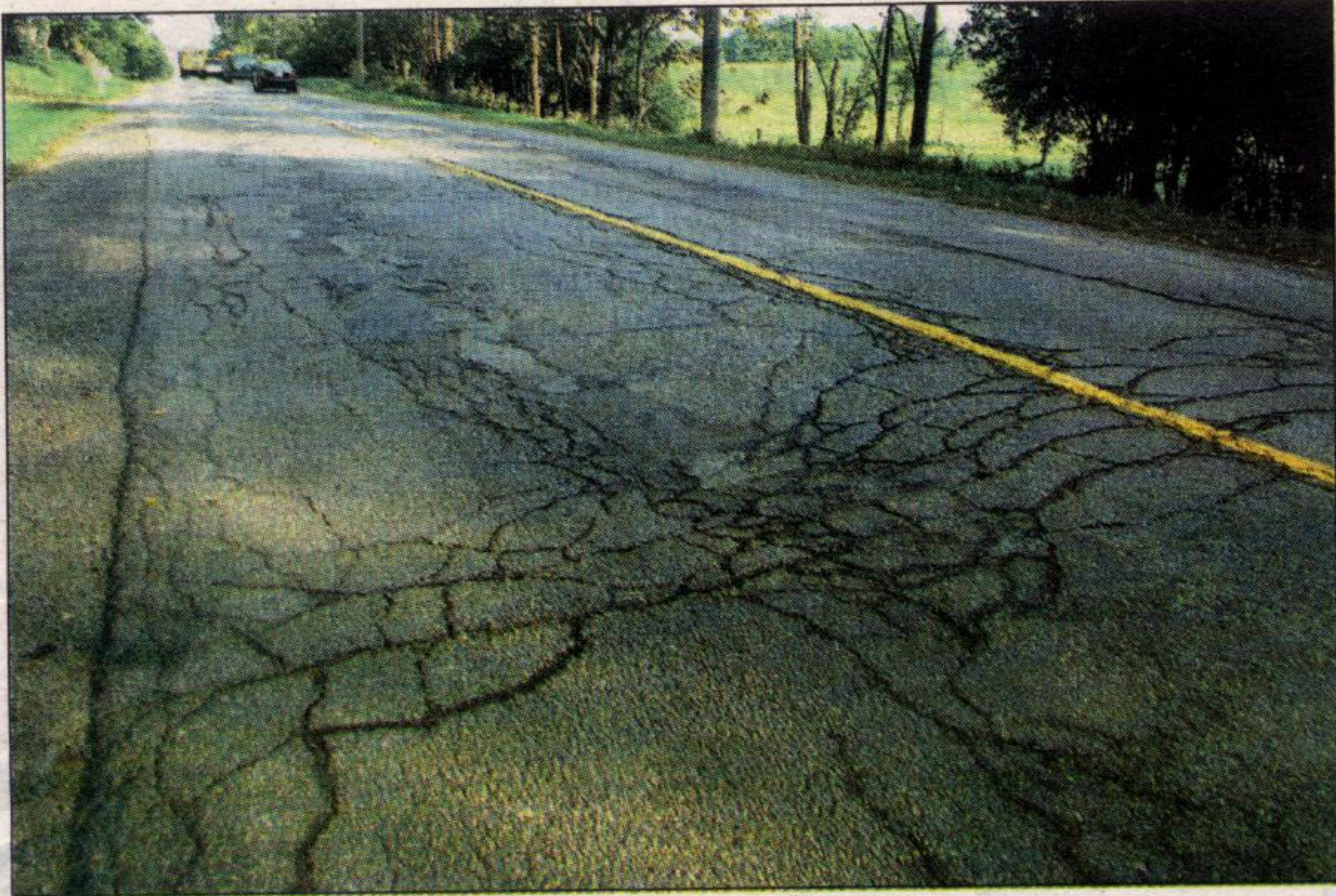
This stretch of Winston Churchill Boulevard, between 10 Sideroad and Steeles Avenue, could be a candidate for Worst Road in Ontario.