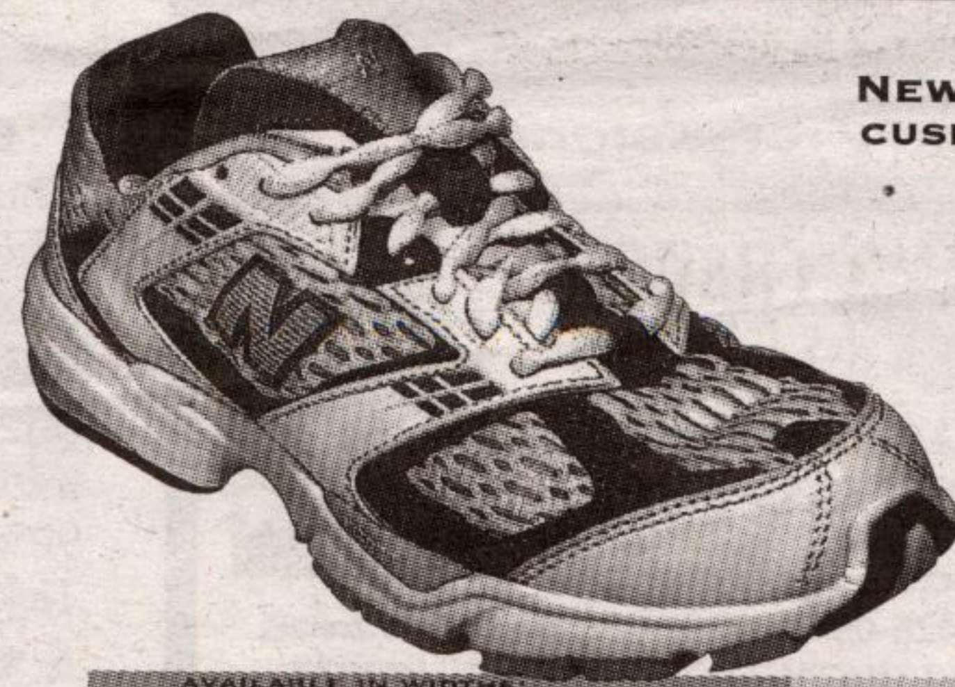
NEW BALANCE 754 CUSHIONING RUNNING

(Across from the Library and Cultural Centre) www.georgetowndentureclinic.com