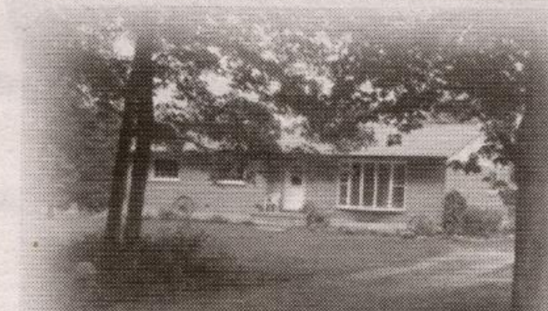
Country Living $300,000

We are working with the producers of the television show "Take This House and Sell It" to help find engaging, outspoken home owners in our area who are having problems SELLING their homes. If chosen, the designers will makeover 3 rooms and the front exterior of your house. Give us a call for more information and to find out if you qualify for this incredible opportunity!