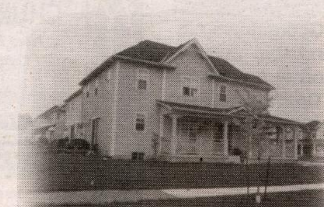
"Honeysuckle" Model $364,900

This open concept brick bungalow has been updated with white kitchen cabinets and pine wainscoting in the dining area, ceramics, hardwood and Berber flooring, separate basement entrance to a rec room w/gas fireplace, 4th bedroom and 3 pc bath with full walkout to a 3 season sunroom and deck on a mature ravine lot overlooking the park.