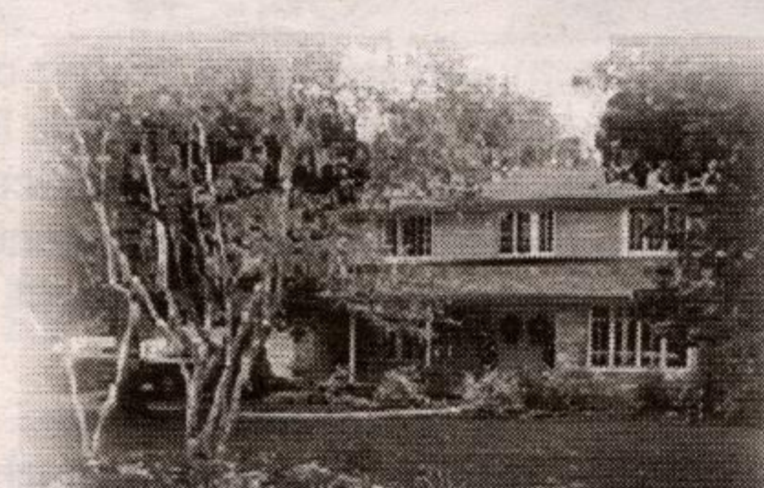
Bramalea Woods Beauty $599,000

This charming 2 Storey 4 BR 3 bath home, with wrap around porch and double garage, is professionally decorated with upgraded flooring and fixtures; Master BR has a 5 pc ensuite and walk-in closet; 2nd floor laundry, main floor Home office; eat-in kitchen with slider walkout; great room with fireplace and finished basement with Rec Room and Playroom.