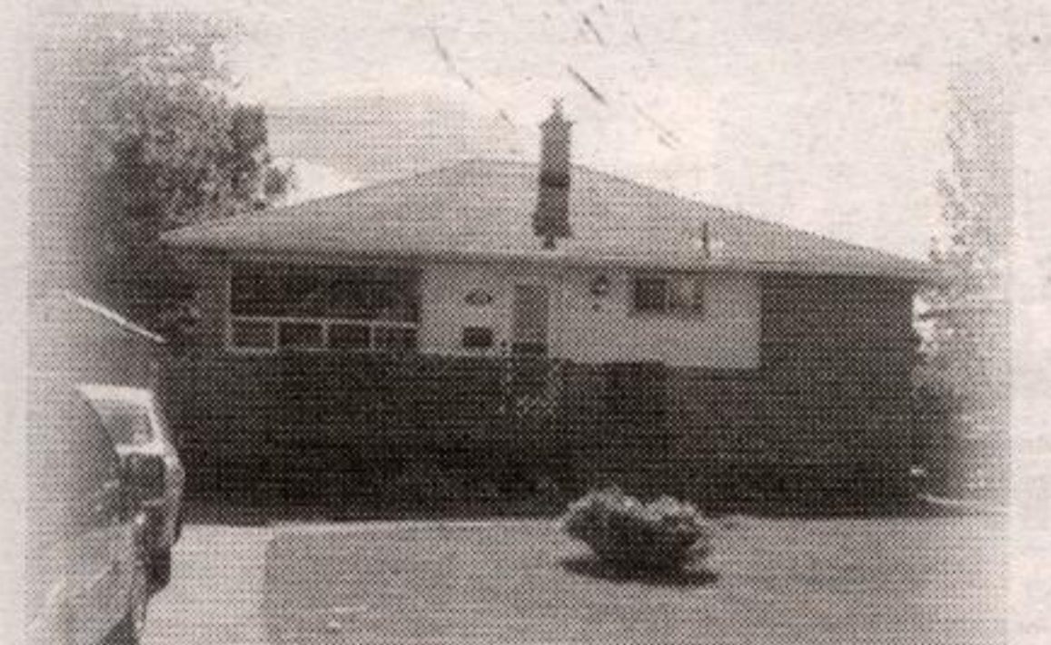
Ravine On The Park $250,000

This spotless 3 BR brick bungalow, on a 1/2 acre lot minutes from town, has been upgraded with new: laminate floors & neutral decor; low maintenance windows; main bath w/ceramics, whirlpool corner tub & separate shower, 12 x 16 ft deck, forced air GAS furnace w/electronic air cleaner and the rec room is nearly complete with r/i woodstove.