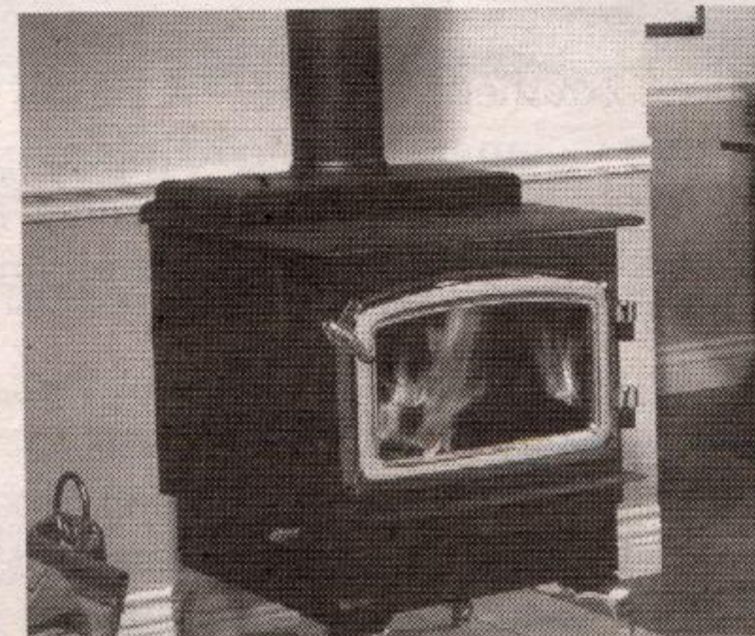
High Efficiency Wood

INSTALL NOW! Don't pay until Jan./06 on Union Financial