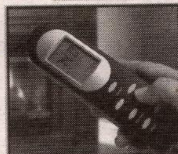
FireGenie™ Remote Control