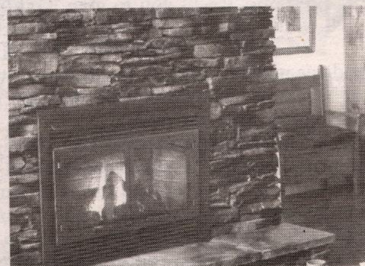
High Efficiency Gas 20 - 50,000 BTU

Call now for your fall furnace maintenance.