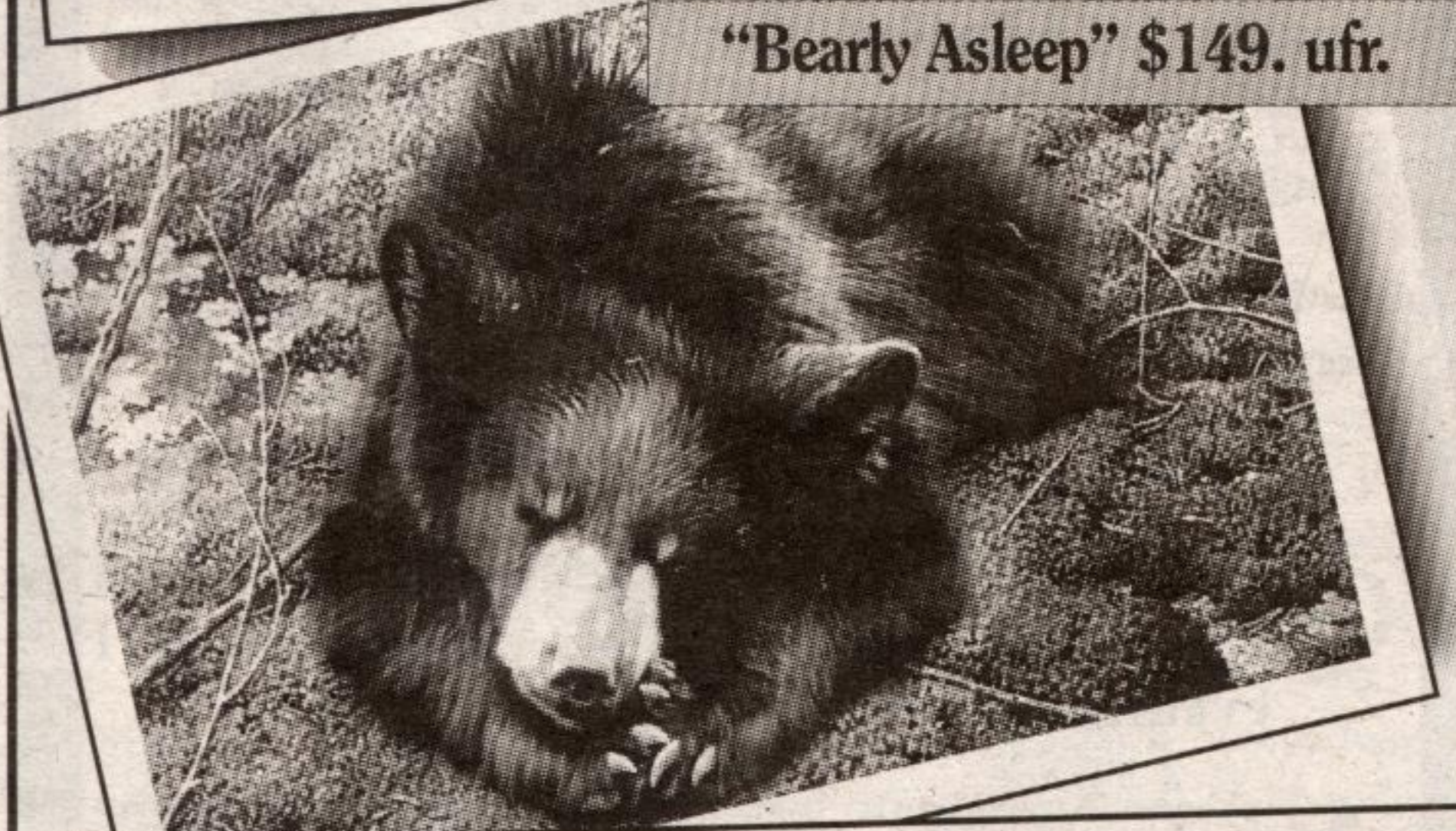
"Bearly Asleep" $149. ufr.