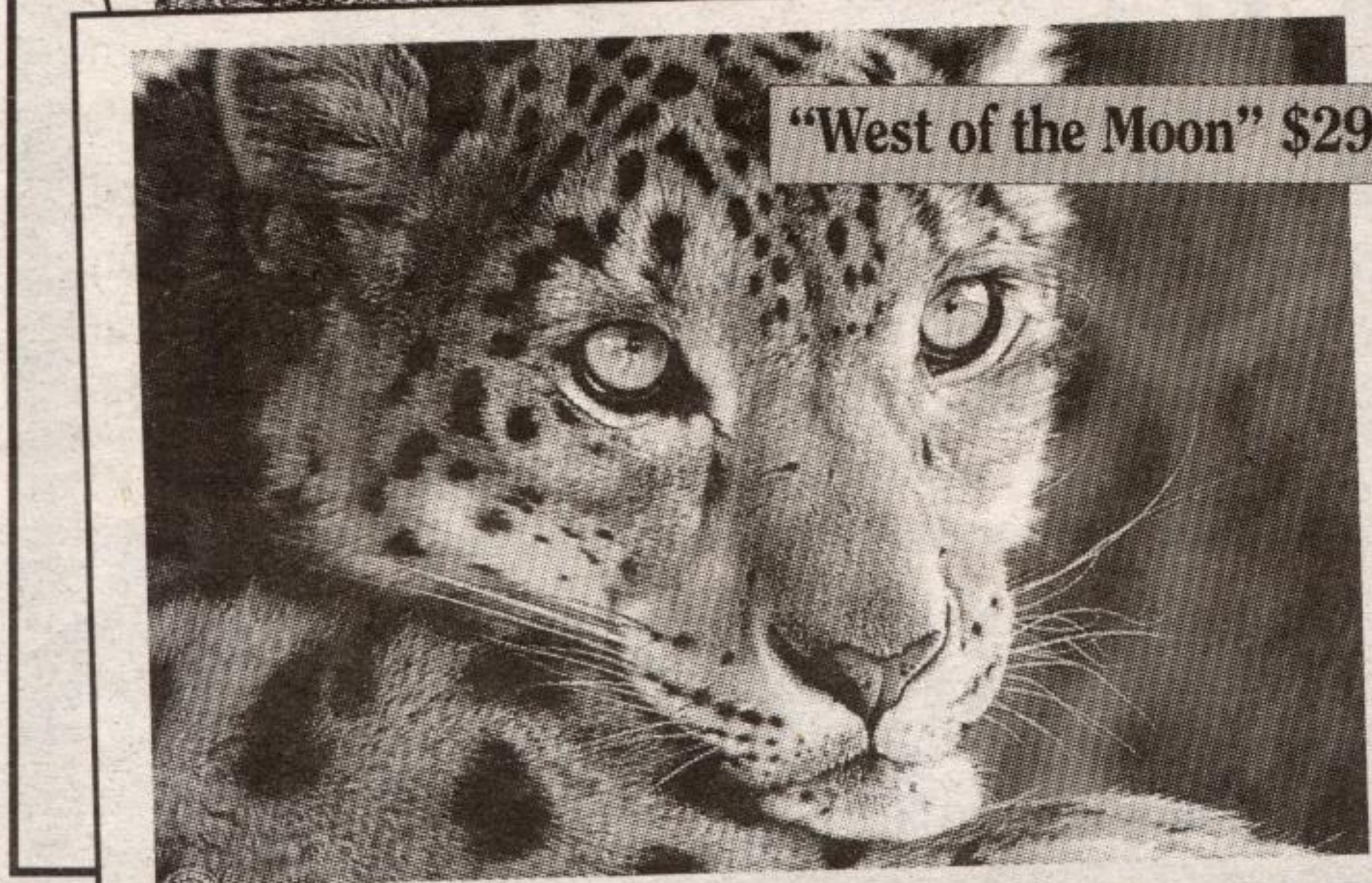
"West of the Moon" $290. ufr.