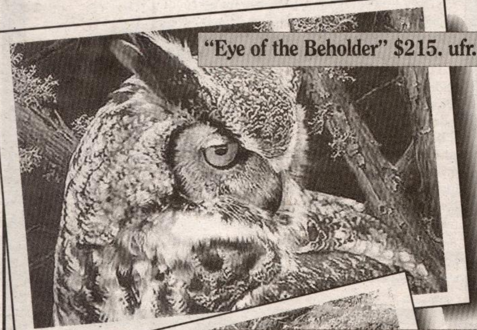
"Eye of the Beholder" $215. ufr.

(Across from the Library and Cultural Centre) www.georgetowndentureclinic.com