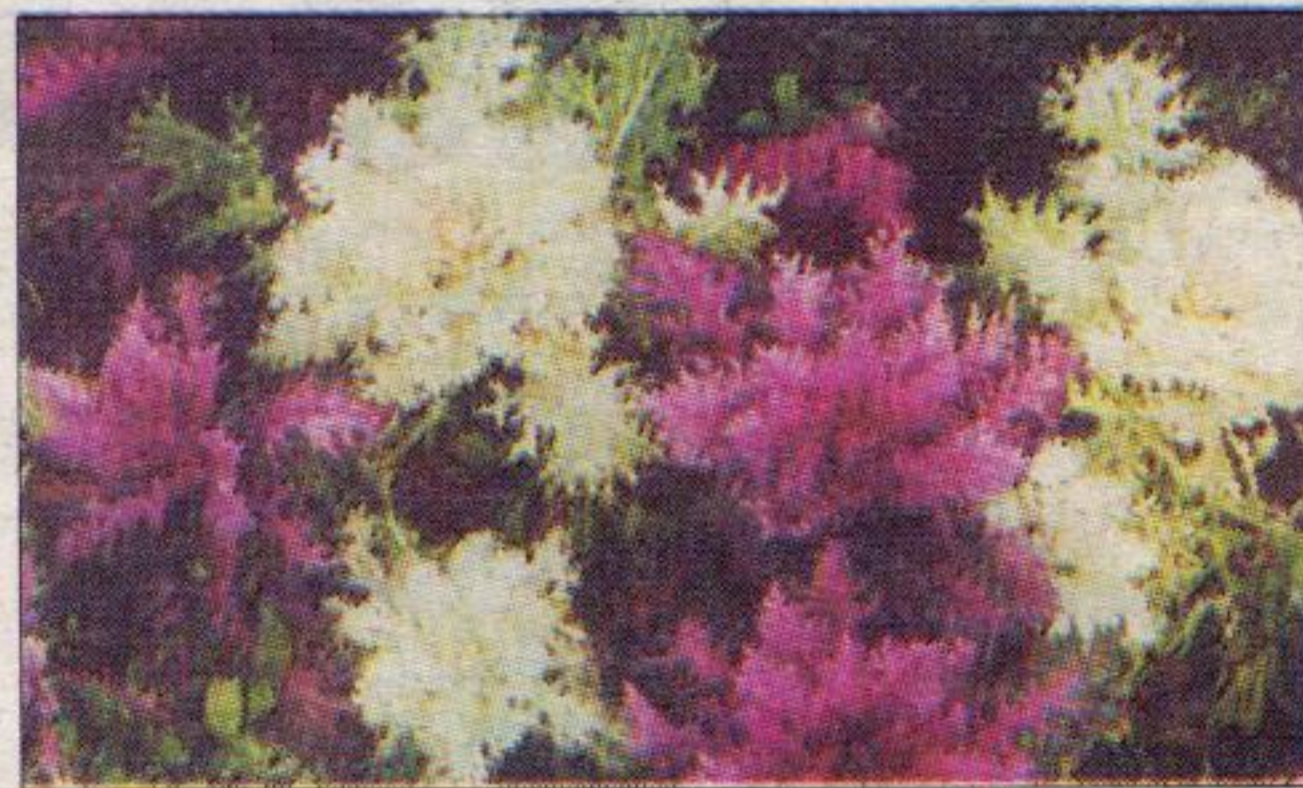
1 gal Ornamental Kale Only $6 99