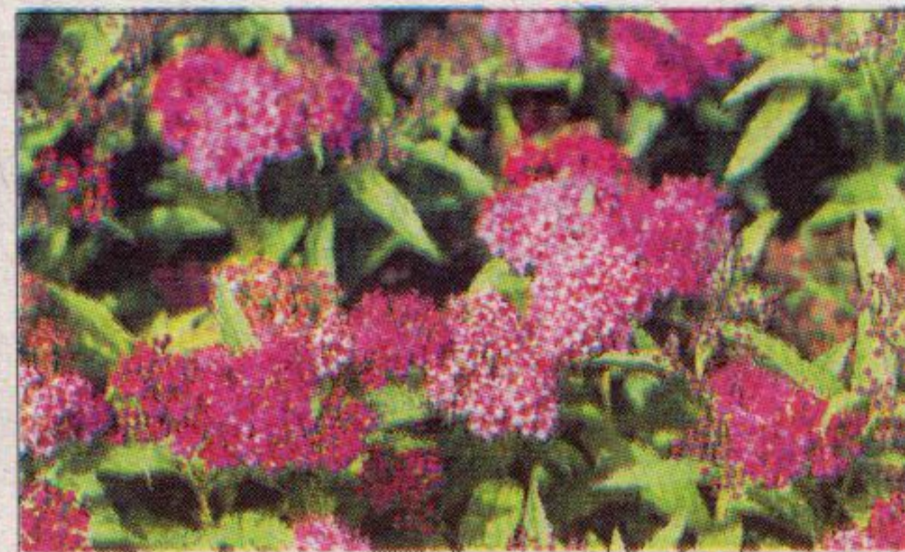
All 2 gal Spirea Reg. 17.99 $6 99

All Patio Furniture and Accessories UP TO 60% OFF