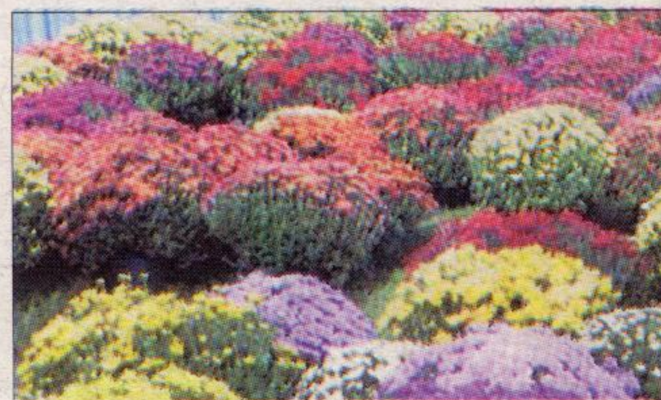
All 2 gal Fall Mums $6 99 each