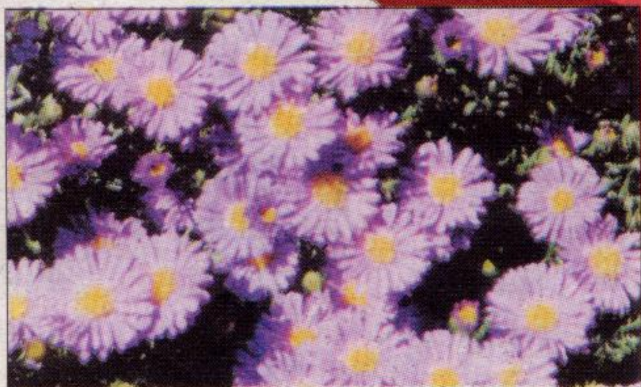
TERRA Sized Fall Asters 3 for $15 00

Moderate temperatures are less stressful (for you and the plant).