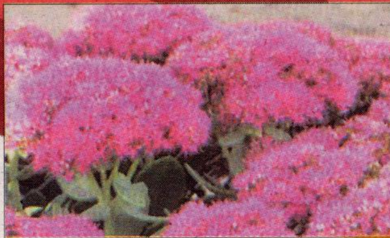
All Sedum 1/2 PRICE