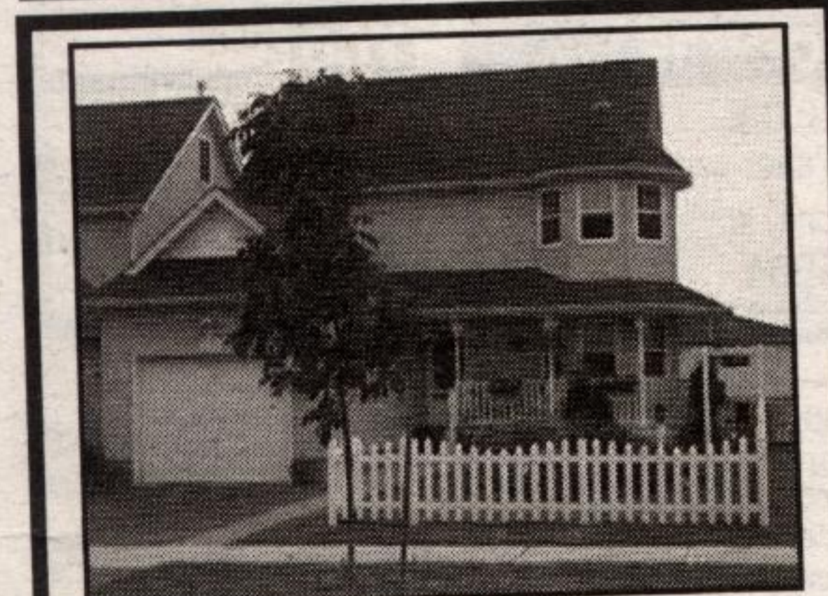
11 DAIRY DRIVE, Acton

Phone 905-877-4017 or 905-702-3334. See more at www.bytheowner.com/26744