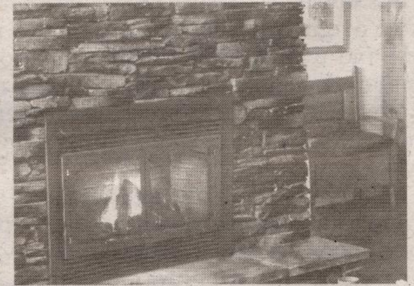
High Efficiency Gas 20 - 50,000 BTU

Call now for your fall furnace maintenance.