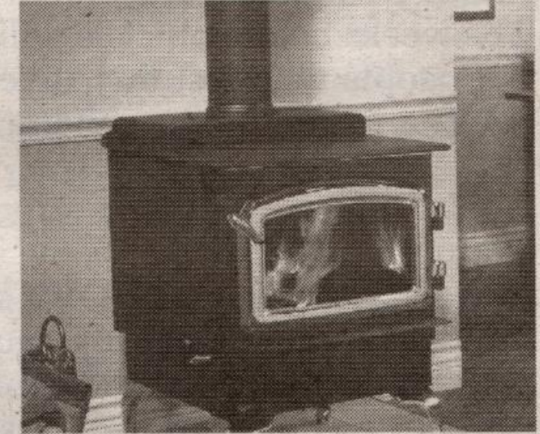
High Efficiency Wood

INSTALL NOW! Don't pay until Jan./06 on Union Financial