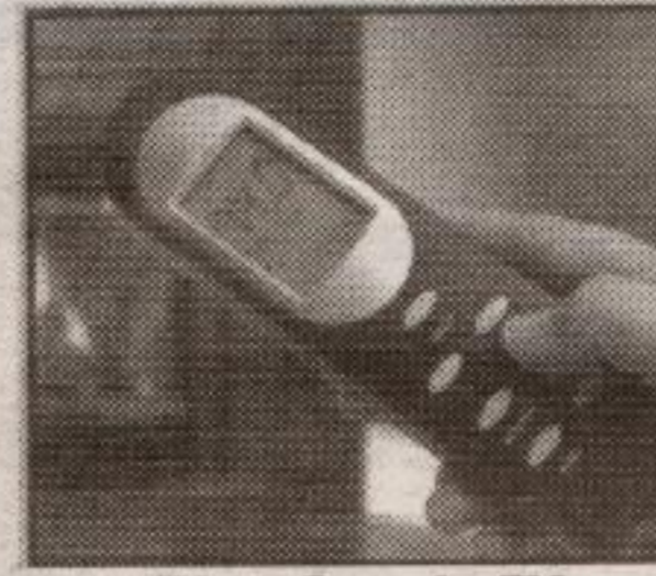
FireGenie™ Remote Control