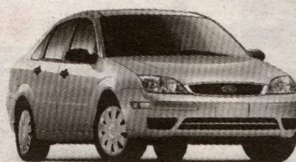
2005 FOCUS ZX4