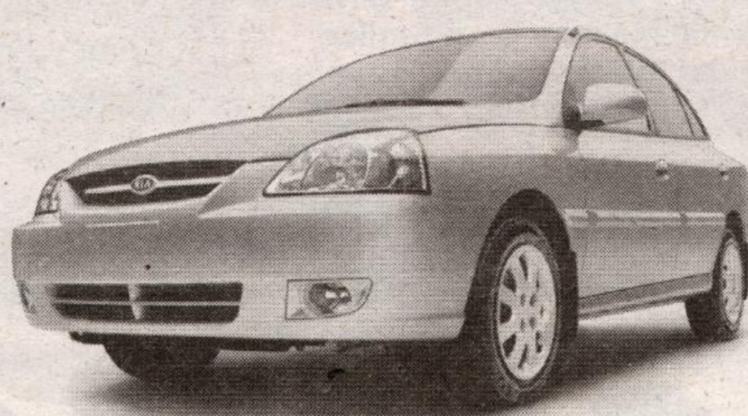
LS model shown!