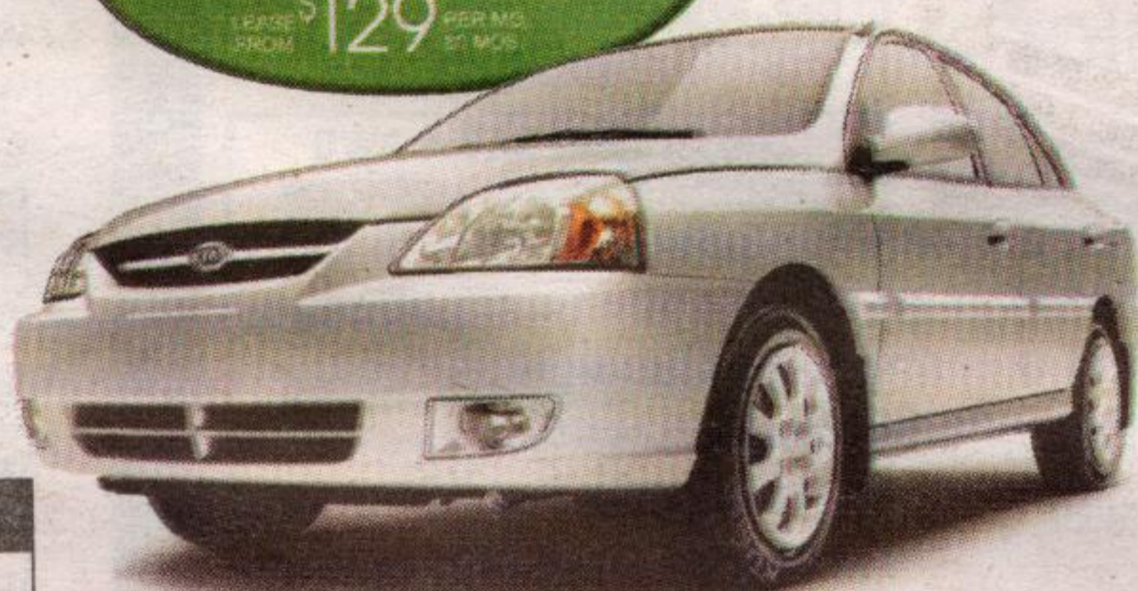
LS model shown

0% PURCHASE FINANCING* 72 MOS. LEASE FROM $129 PER MO. 60 MOS. $0 SECURITY DEPOSIT