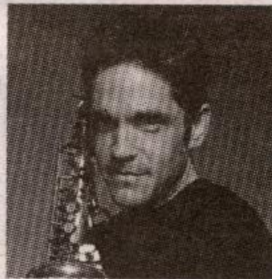
Dave Koz & Friends