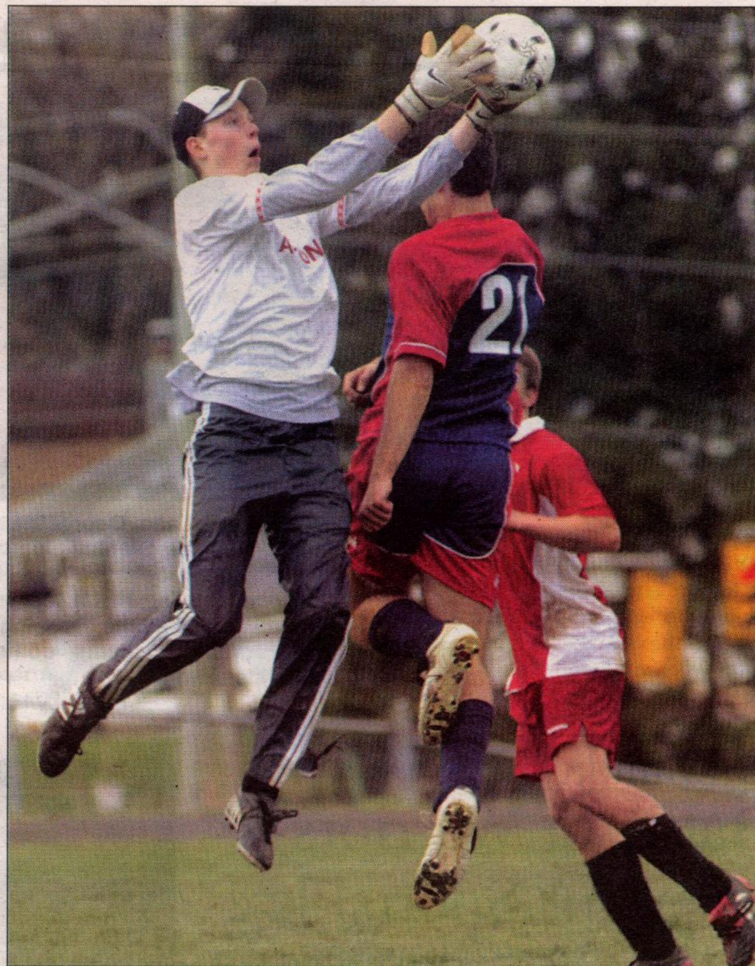
Gotta hand it to him