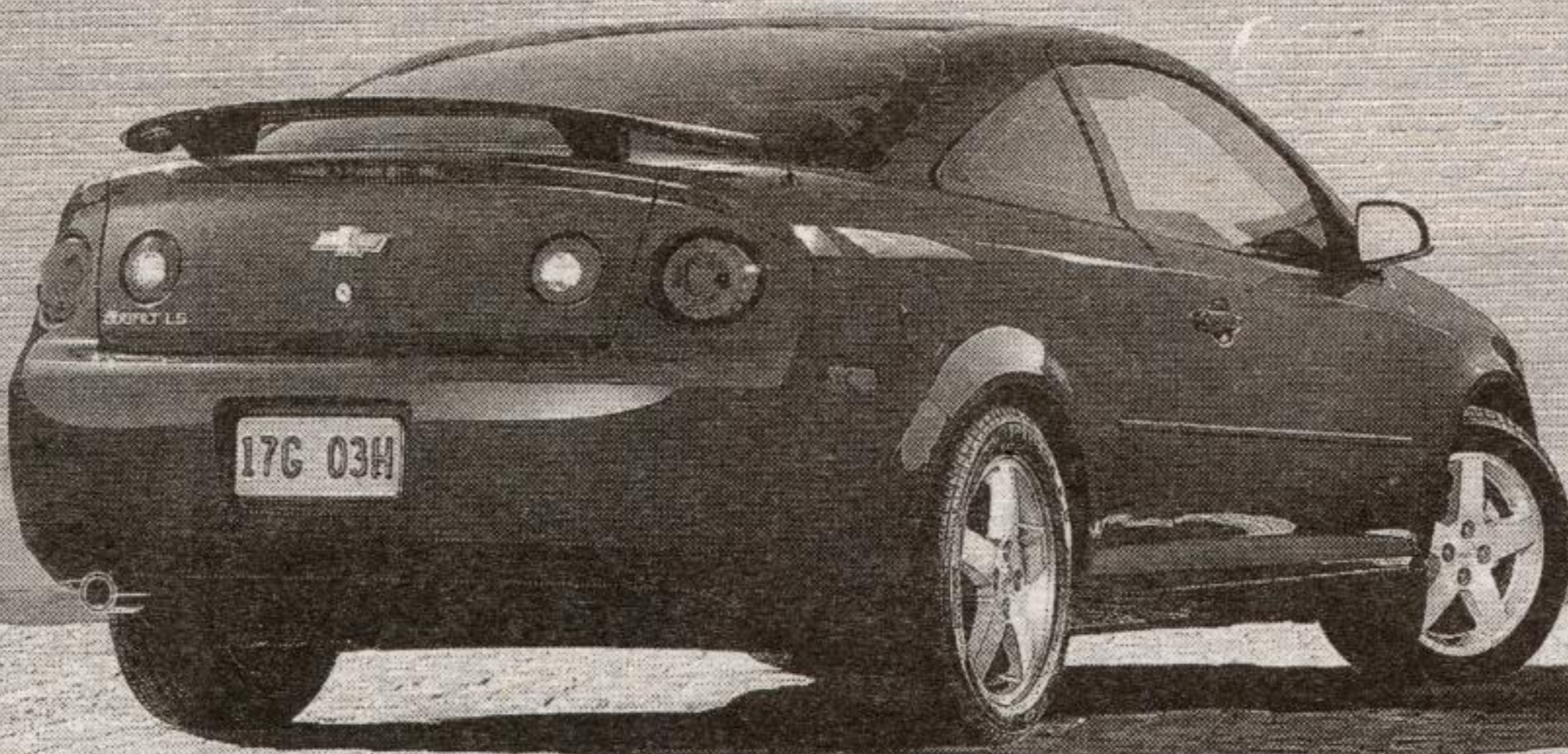
Cobalt Coupe LS with Sports Appearance Package and 16" Aluminum Wheels