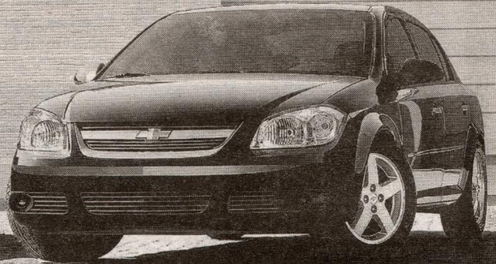
Cobalt LT Sedan