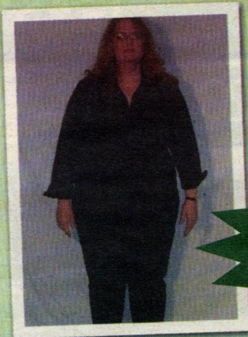
Eleanor lost 103 pounds and 118 inches