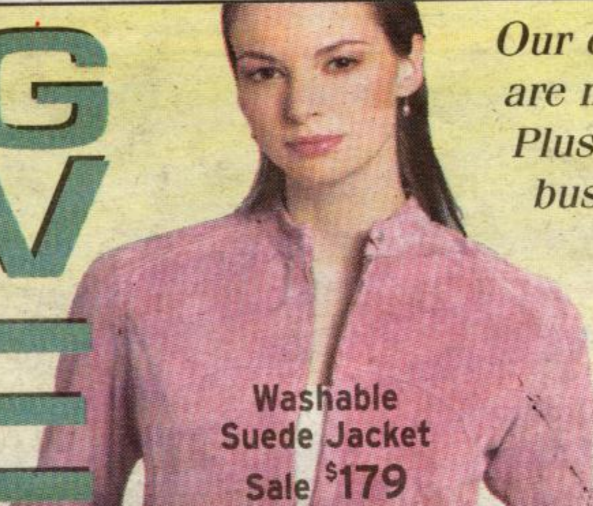
Washable Suede Jacket Sale $179

Our entire collection of leather and suede fashions are now on sale, including all new spring arrivals. Plus great gift ideas for mom. Handbags, wallets, business cases, belts, slippers and much more.