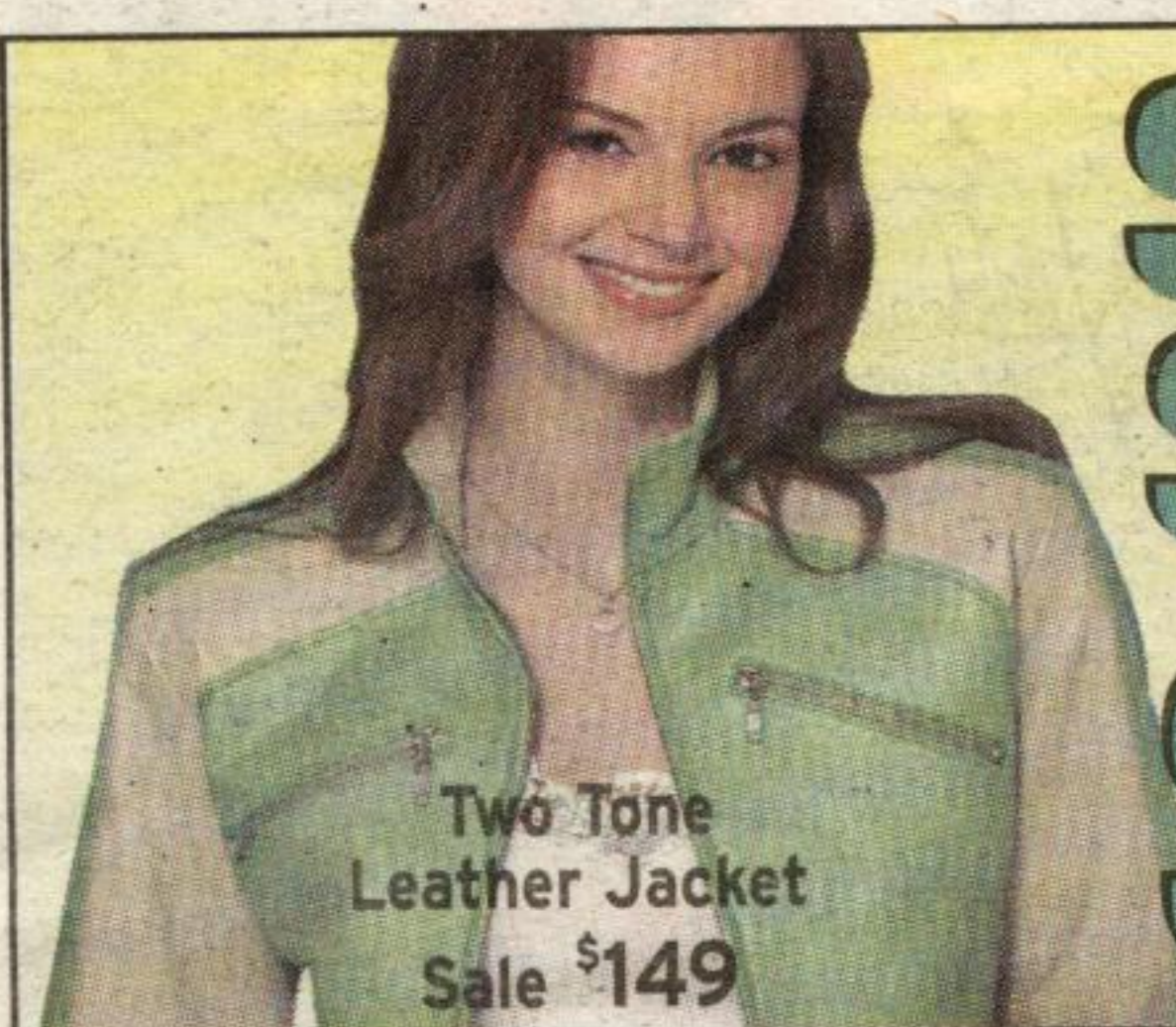
Two Tone Leather Jacket Sale $149