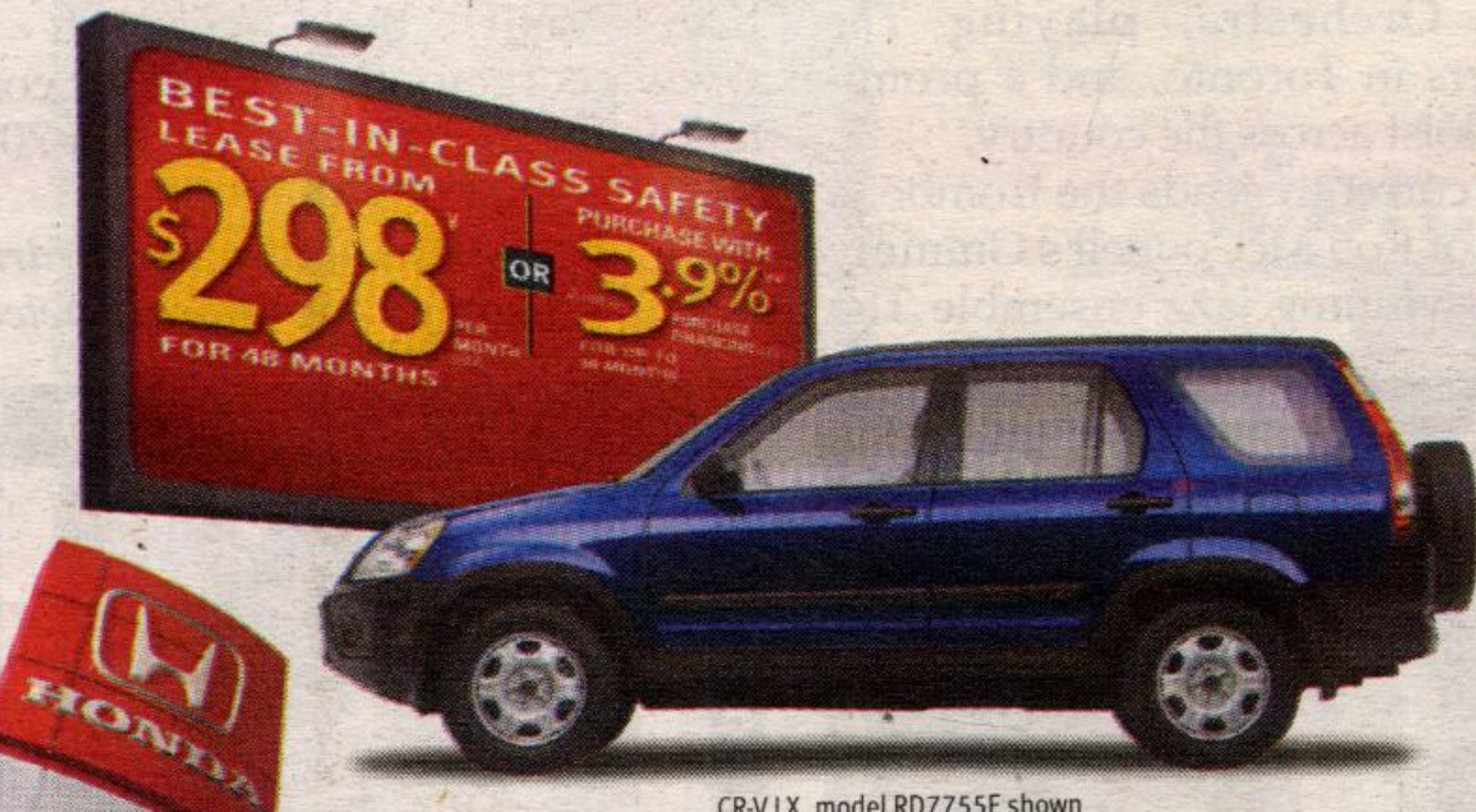
CR-V LX, model RD7755E shown

LEASE FOR 48 MONTHS $298 PER MONTH D.A.C. WITH $4,912 DOWN