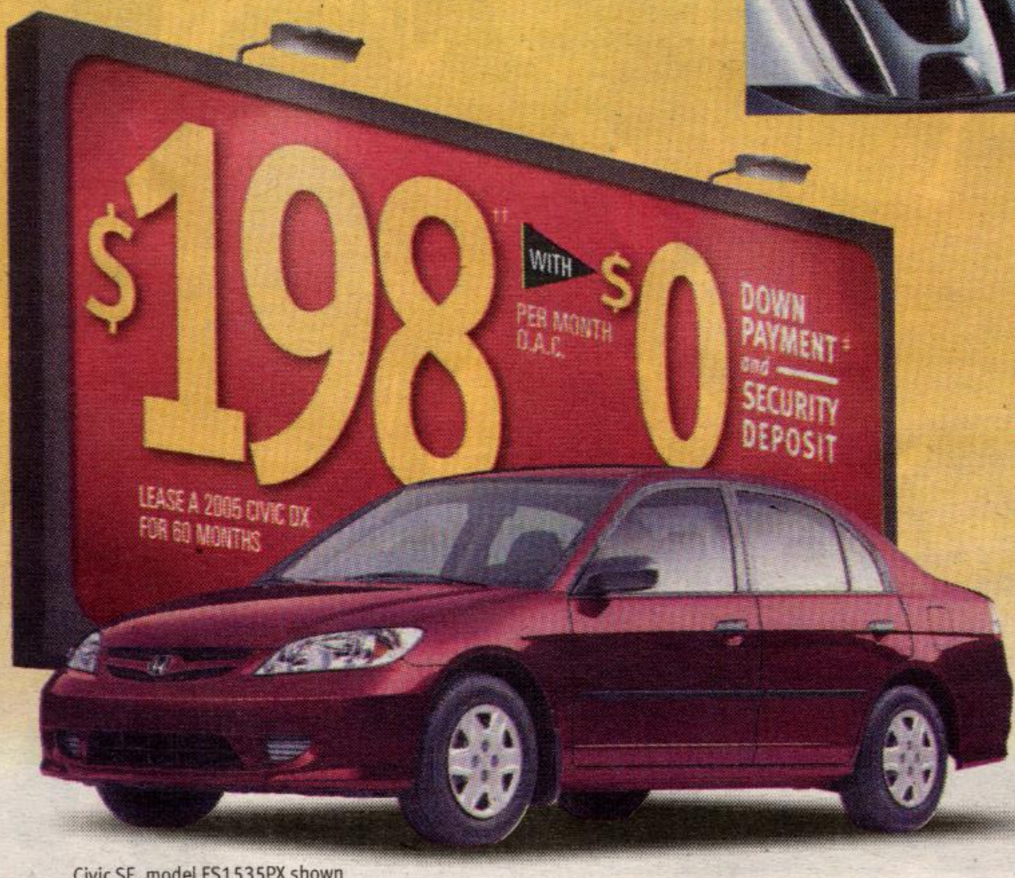
Civic SE, model ES1535PX shown

LEASE FOR 60 MONTHS $198 PER MONTH D.A.C. OR PURCHASE FOR $16,200