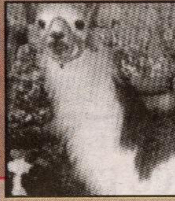
"ROMEO" THE LLAMA