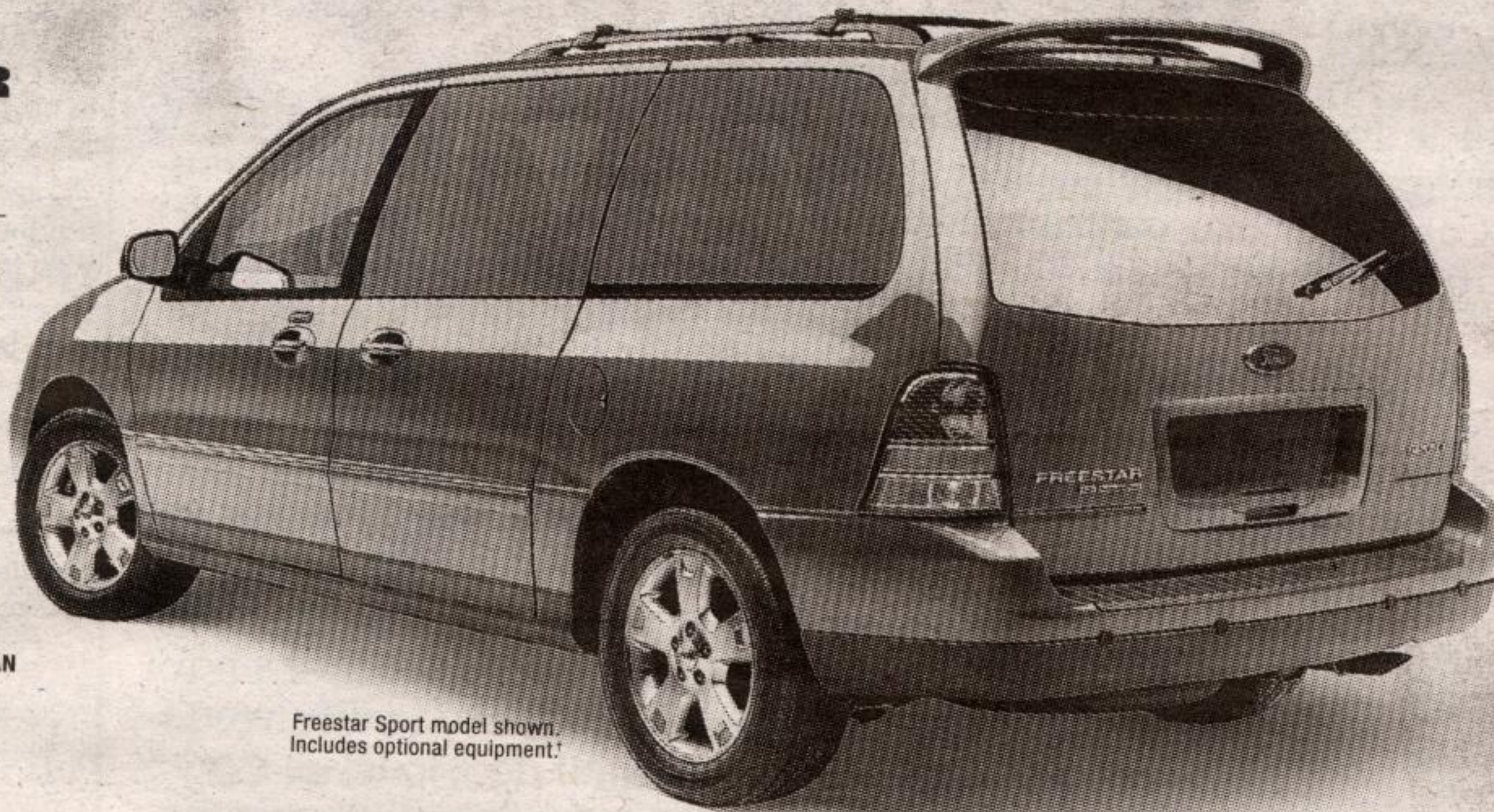
Freestar Sport model shown. Includes optional equipment.†

CAA PYRAMID AWARD FOR SAFETY INNOVATIONS® CANADIAN DRIVING PACKAGE