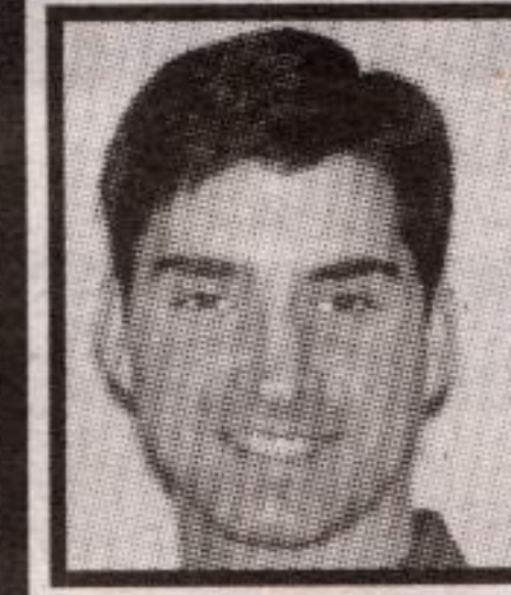
By Cory Soal R.H.A.D.

For more information about property assessment, refer to the insert included with each property assessment notice, visit MPAC's website, www.mpac.ca or call its Customer Contact Centre, 1-866-296-MPAC (6722).