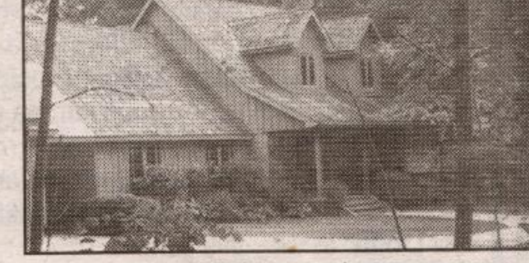
Halton Hills - $599,000