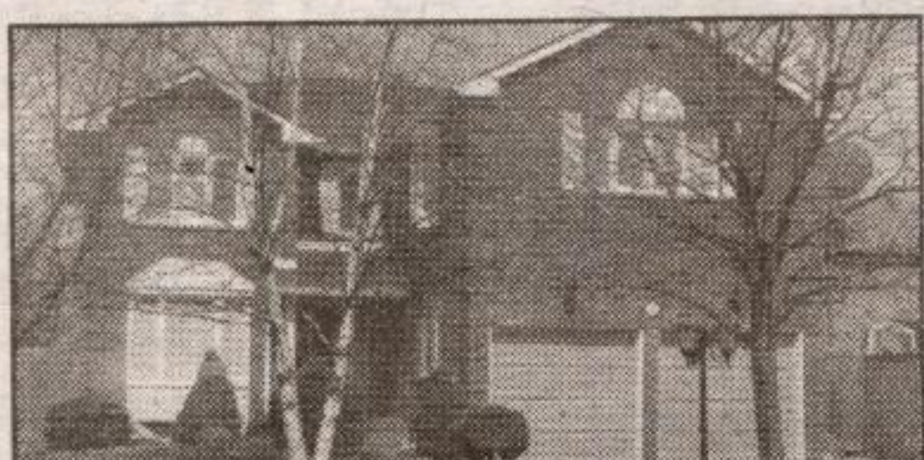
Brampton - $359,900