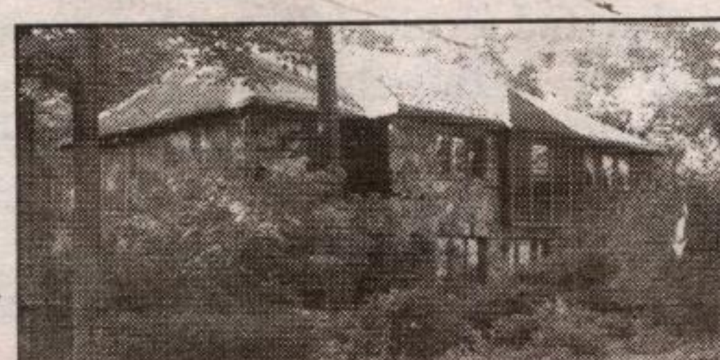
Belfountain - $899,000