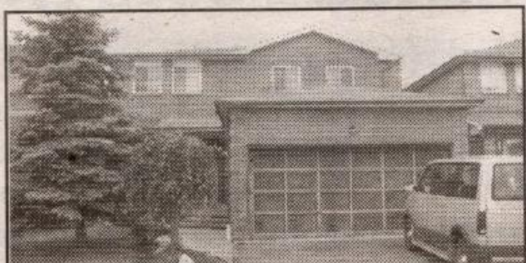
Brampton - $269,900