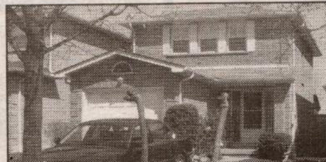
Brampton - $269,900