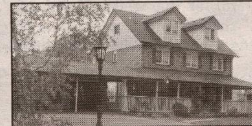
Ballinafad - $499,000