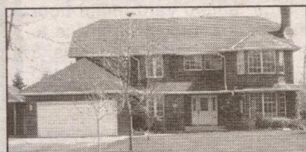
Ballinafad - $469,000