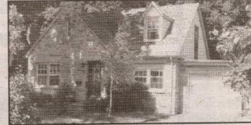
Georgetown - $299,000