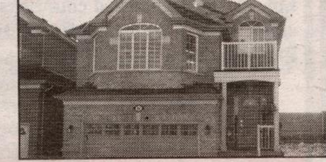
Brampton - $324,900