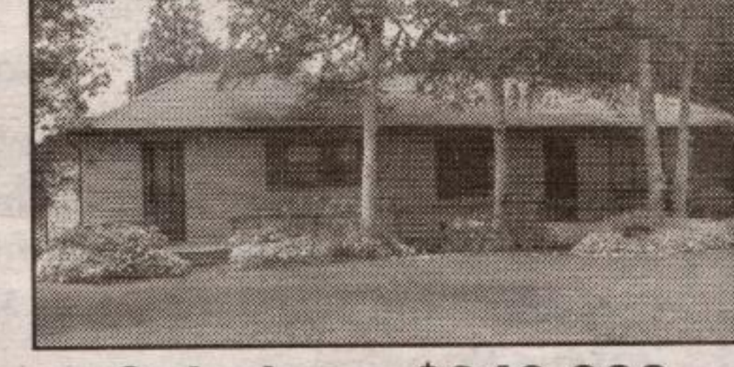
Caledon - $349,900