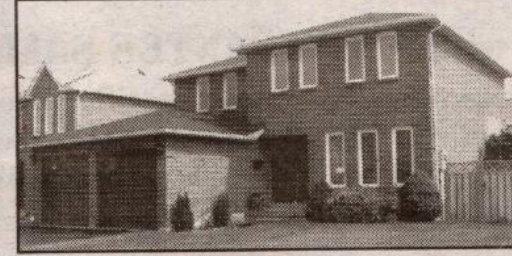
Brampton - $369,000