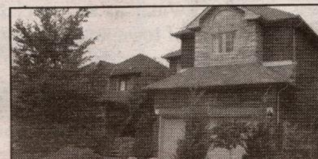
Georgetown - $379,900