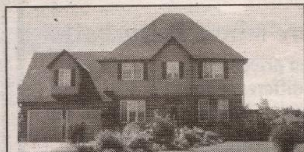
Campbellville - $459,000