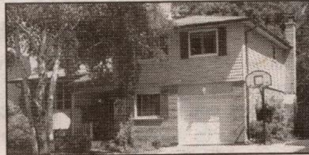
Acton - $262,900