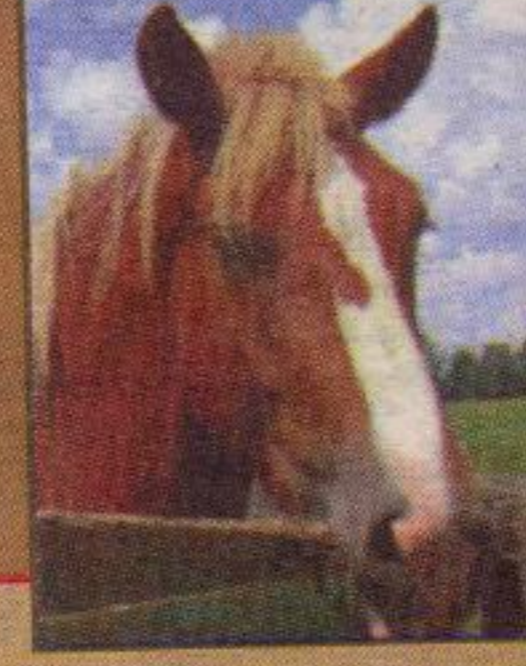
"CHIEF" THE BELGIAN DRAFT HORSE 17 HANDS