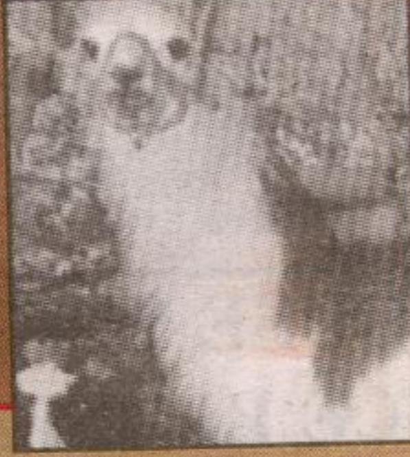
"ROMEO" THE LLAMA