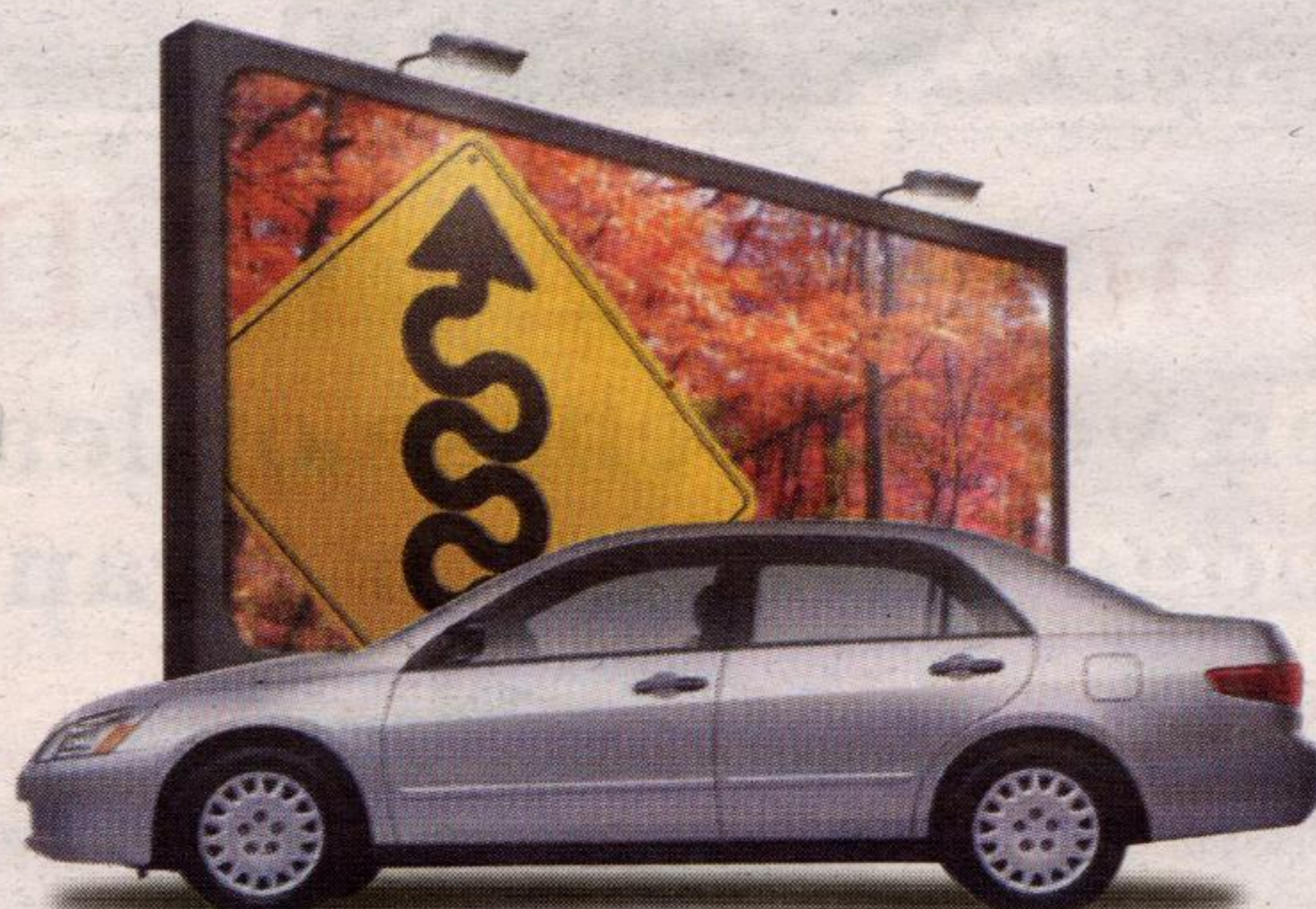
Accord Sedan DX, model CM5615E shown

2005 ACCORD SEDAN DX By any standard, our most affordable Accord is feature loaded: ▶ 2.4L 160HP DOHC i-VTEC™ ENGINE ▶ 5-SPEED AUTOMATIC TRANSMISSION ▶ INDEPENDENT FRONT AND REAR DOUBLE WISHBONE SUSPENSION ▶ POWER WINDOWS & 2-STAGE POWER DOOR LOCKS ▶ KEYLESS REMOTE ENTRY ▶ CRUISE CONTROL ▶ DRIVER'S SEAT HEIGHT ADJUSTMENT ▶ CFC-FREE A/C WITH MICRON AIR FILTRATION ▶ AM/FM/CD STEREO ▶ TILT & TELESCOPIC STEERING WHEEL ▶ CENTRE CONSOLE ARMREST WITH STORAGE ▶ NEW TAILLIGHT BULB AND LENS DESIGN ▶ REAR HEATER DUCTS AND MUCH MORE.