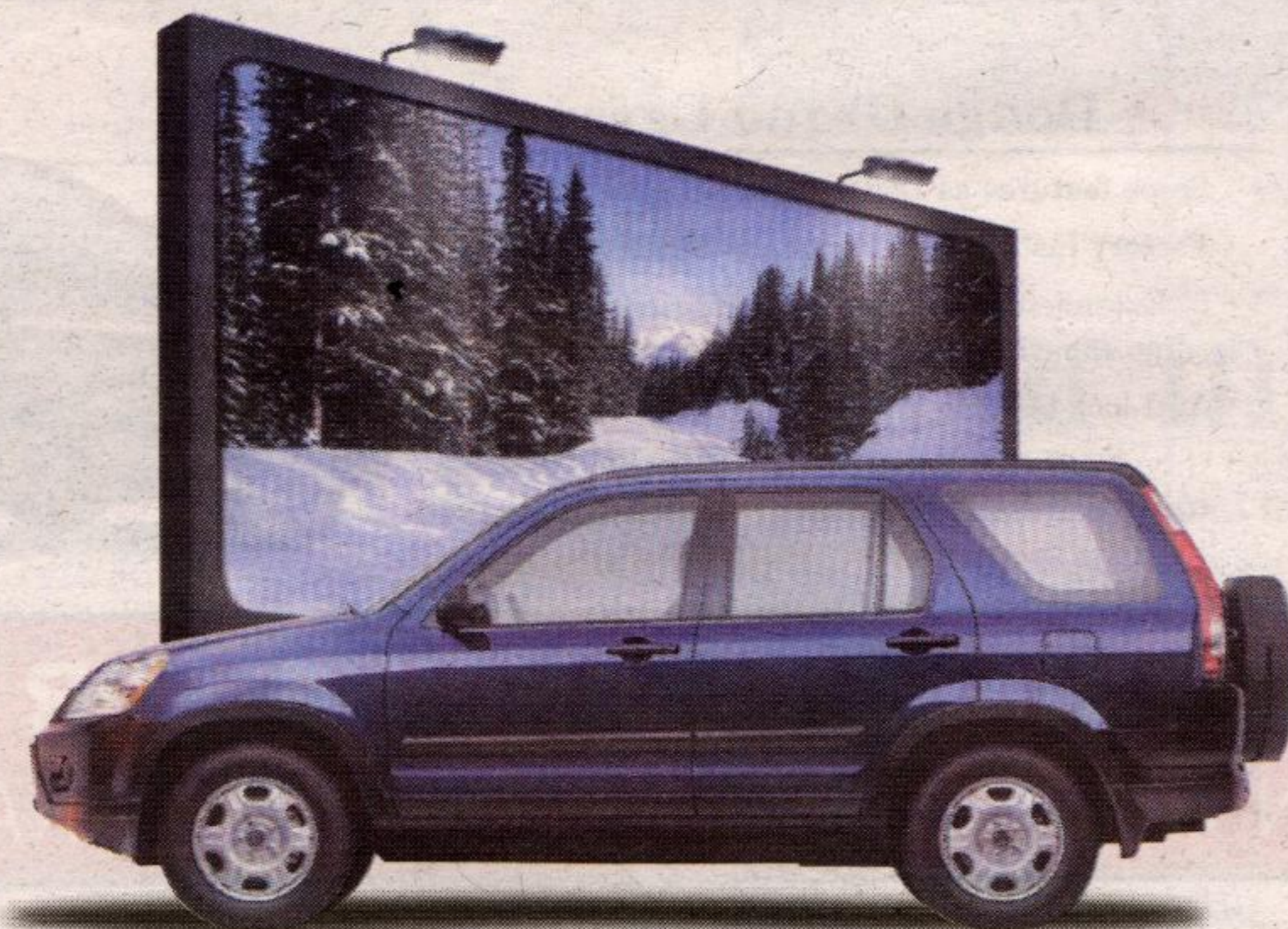
CR-V LX, model RD7755E shown

2005 ACCORD SEDAN DX By any standard, our most affordable Accord is feature loaded: ▶ 2.4L 160HP DOHC i-VTEC™ ENGINE ▶ 5-SPEED AUTOMATIC TRANSMISSION ▶ INDEPENDENT FRONT AND REAR DOUBLE WISHBONE SUSPENSION ▶ POWER WINDOWS & 2-STAGE POWER DOOR LOCKS ▶ KEYLESS REMOTE ENTRY ▶ CRUISE CONTROL ▶ DRIVER'S SEAT HEIGHT ADJUSTMENT ▶ CFC-FREE A/C WITH MICRON AIR FILTRATION ▶ AM/FM/CD STEREO ▶ TILT & TELESCOPIC STEERING WHEEL ▶ CENTRE CONSOLE ARMREST WITH STORAGE ▶ NEW TAILLIGHT BULB AND LENS DESIGN ▶ REAR HEATER DUCTS AND MUCH MORE.