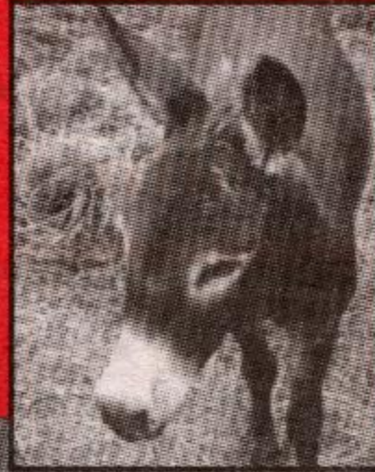
"NIFTY" THE MINIATURE DONKEY

ROYAL LEPAGE RCR Realty, BROKER INDEPENDENTLY OWNED AND OPERATED