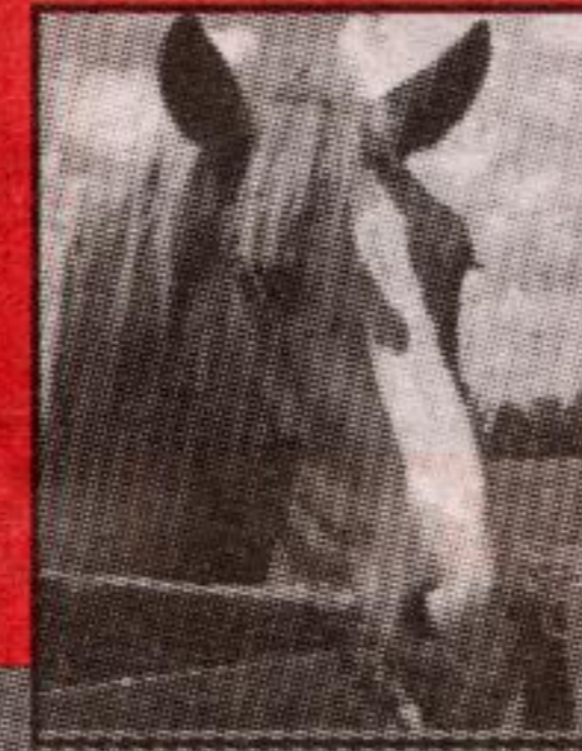
"CHIEF" THE BELGIAN DRAFT HORSE 17 HANDS