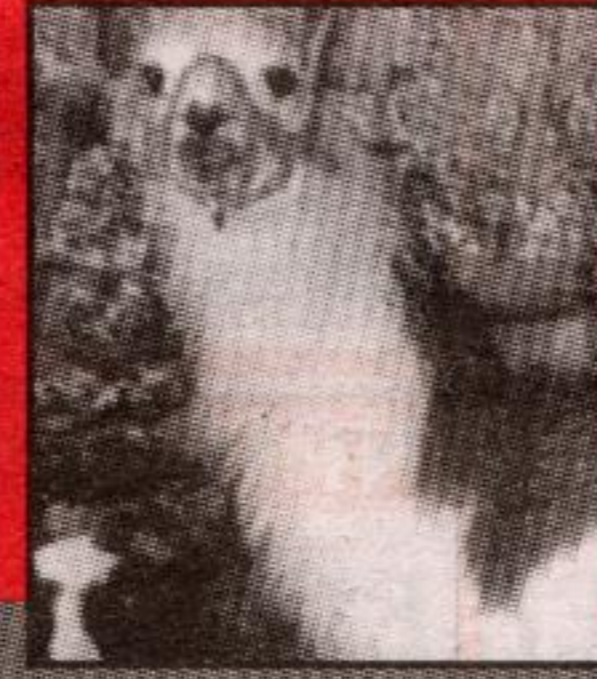
"ROMEO" THE LLAMA