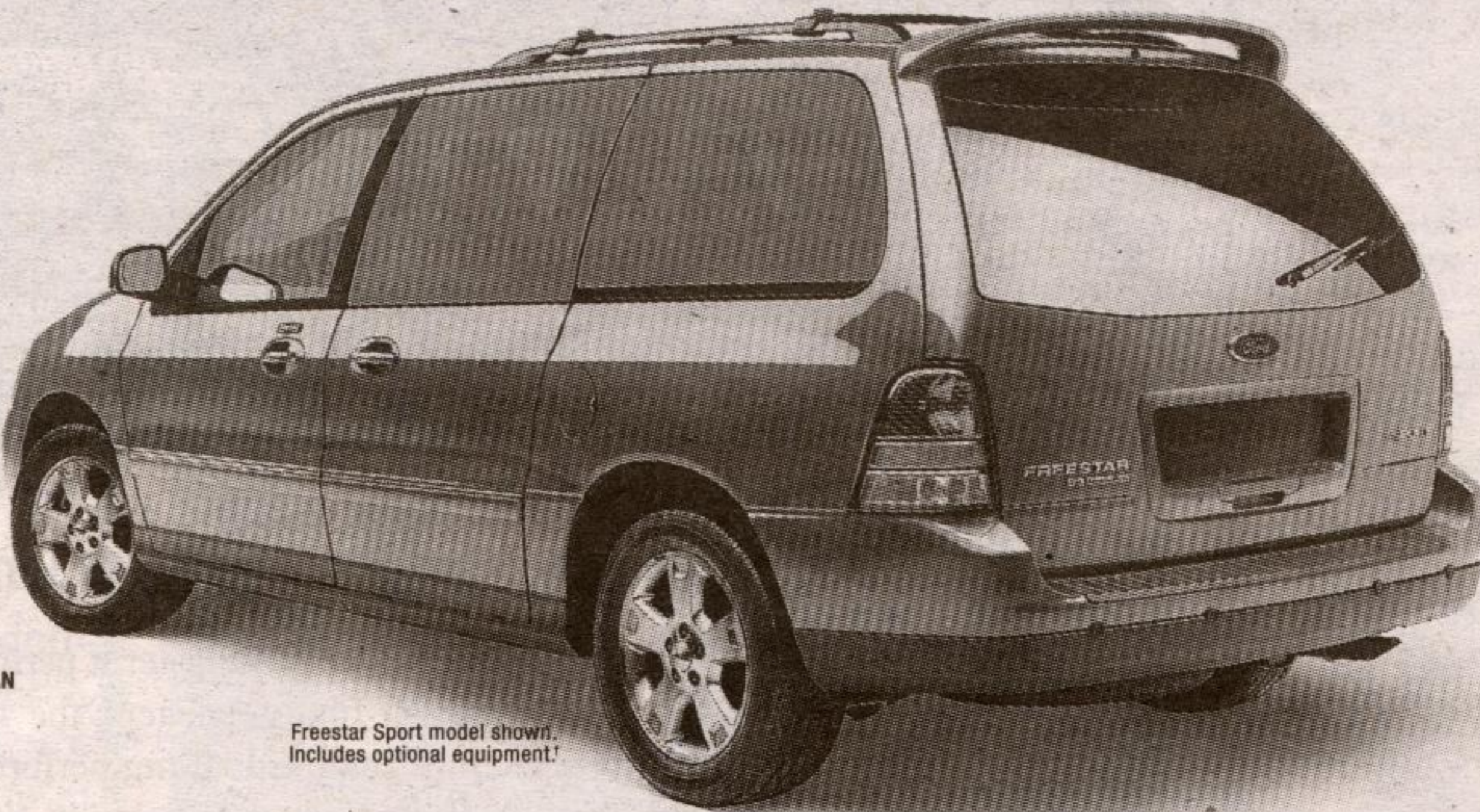
Freestar Sport model shown. Includes optional equipment!‡

CAA PYRAMID AWARD FOR SAFETY INNOVATIONS® CANADIAN DRIVING PACKAGE