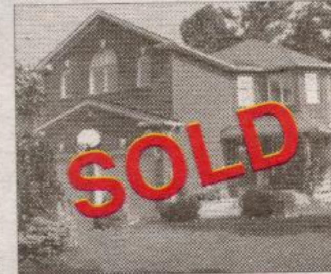
47 Gollop Cres.