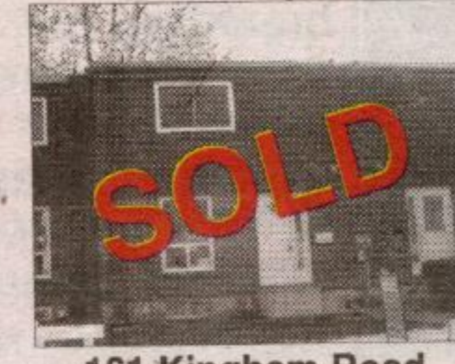
161 Kingham Road