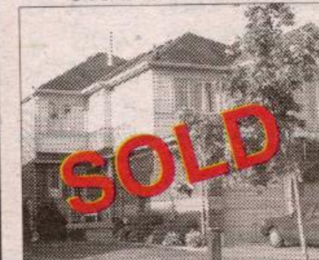
21 Emslie Drive