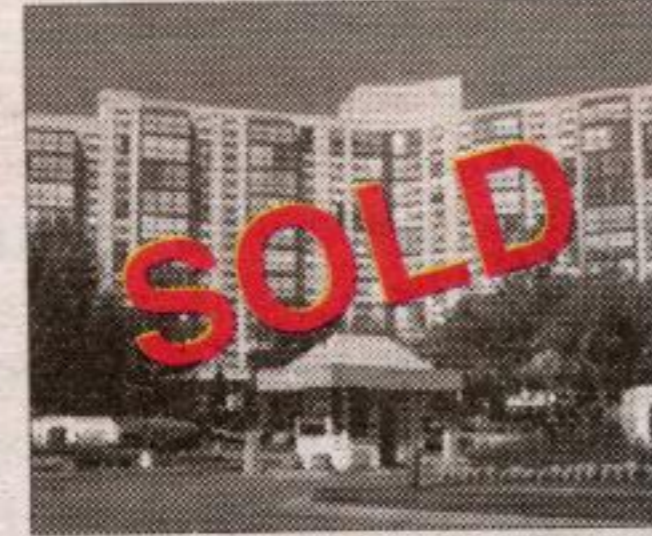
40 Harding Blvd.