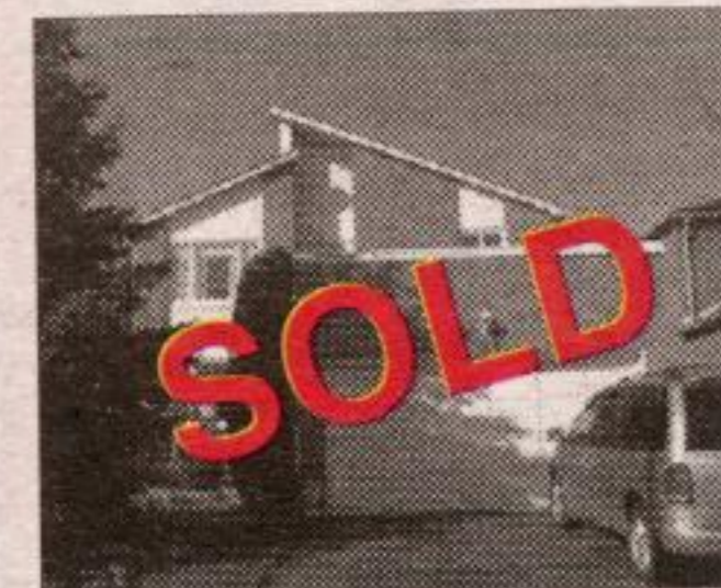
319 Barber Drive