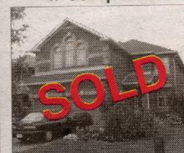
23 Miller Drive