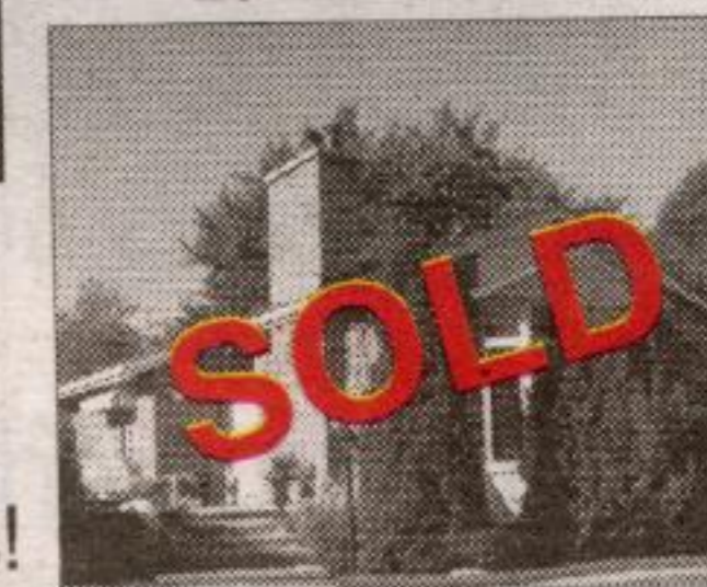
6 Southwell Drive