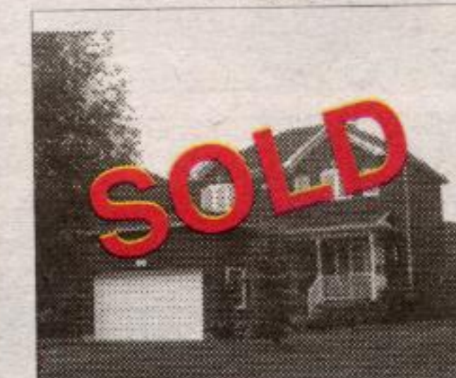
25 Oak Street