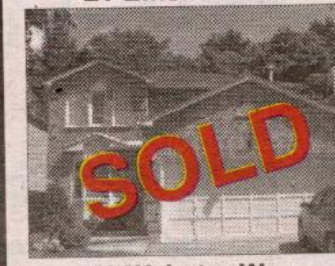
42 Webster Way