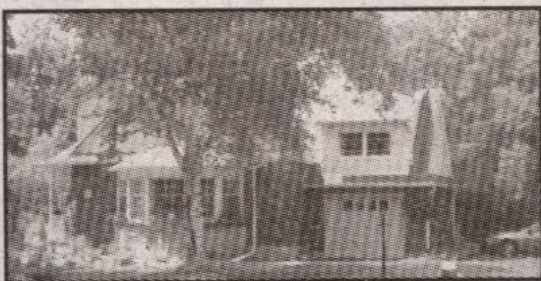
241 Arthur St. Acton

Charming unique home loaded with character, mature trees/grounds, 66x132 lot, 3 bedrooms, new kitchen and updated throughout, hardwood floors, gas fireplace. Must see to appreciate. $294,000. 519-853-0423