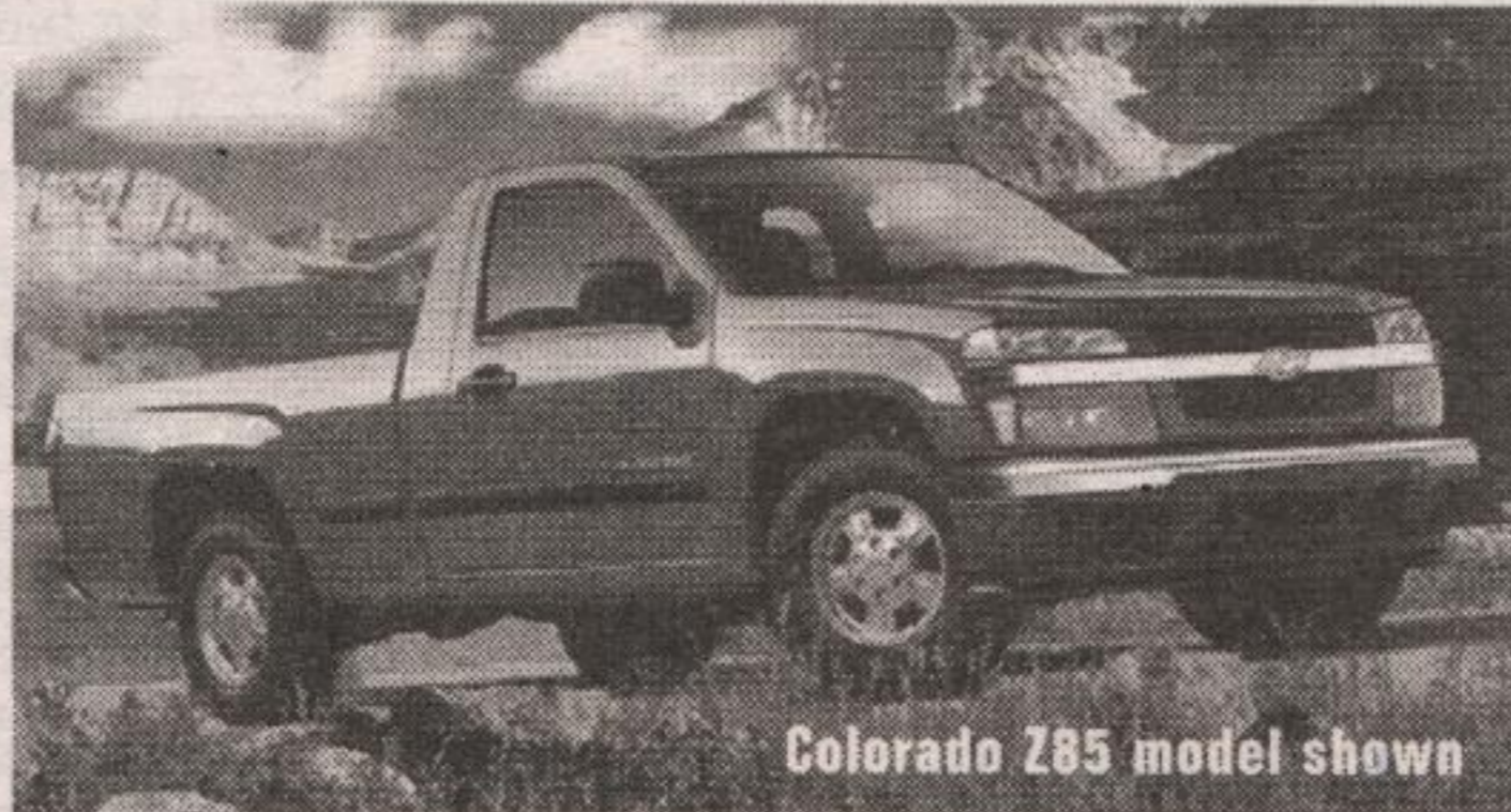
Colorado 285 model shown

Silverado R7H • 285-HP Vortec 4800 V8 Engine • 4-Speed Automatic with Overdrive • Dual Zone Air Conditioning • Locking Differential • ABS • 40/20/40 Split Front Bench with Custom Cloth Trim • Tilt Steering • Automatic Headlights • Full Instrumentation Including: Tachometer, Engine Hourmeter and Driver Message Centre