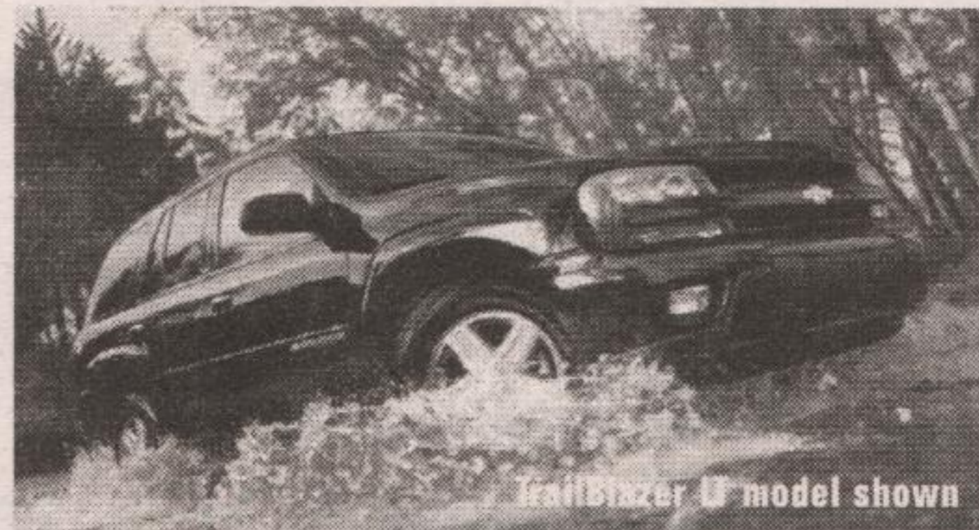
TrailBlazer 4x4 model shown

175 HP Vortec 2800 DOHC Engine • ABS • 5-Speed Manual • 2 Position Locking Tailgate • 15" Wheels