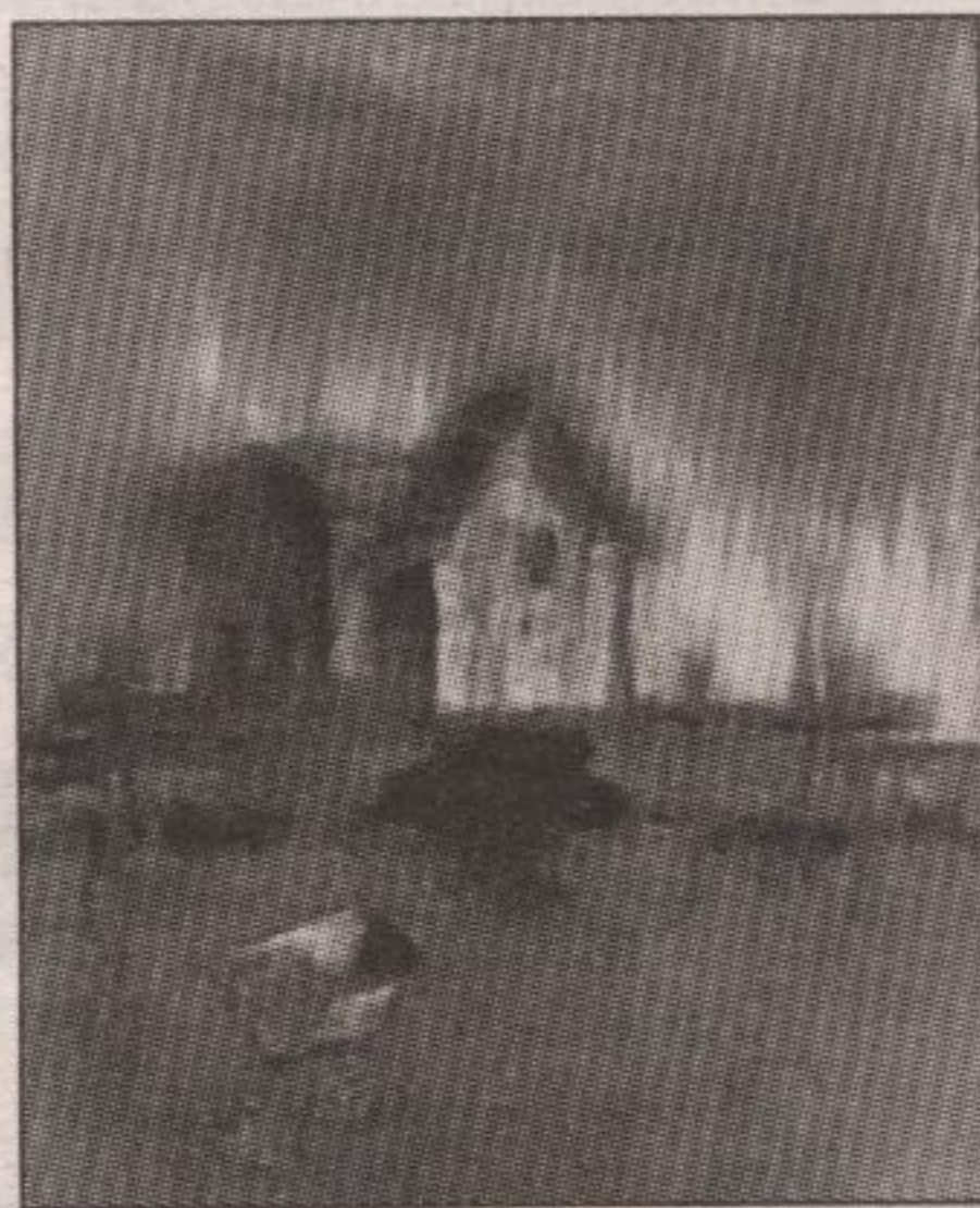
Albert's Wharf by George Perdue, oil on canvas.

Showcasing the varied styles and mediums of these six artists, the show is open weekends from September 25 to October 11, from 11 a.m. to 4 p.m. The Innerscapes Gallery is located at 13261 Tenth Line