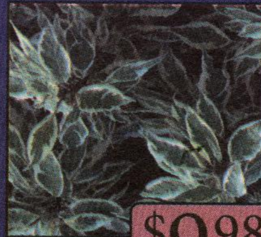
Ivory Halo Dogwood