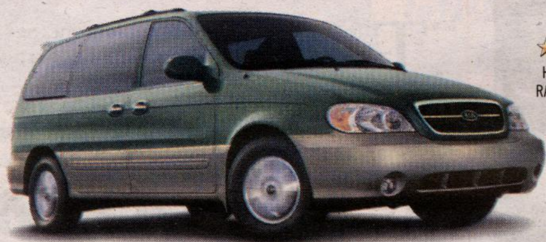
EX-L model shown 1