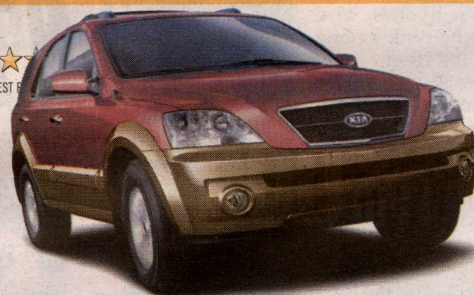
EX model shown 1