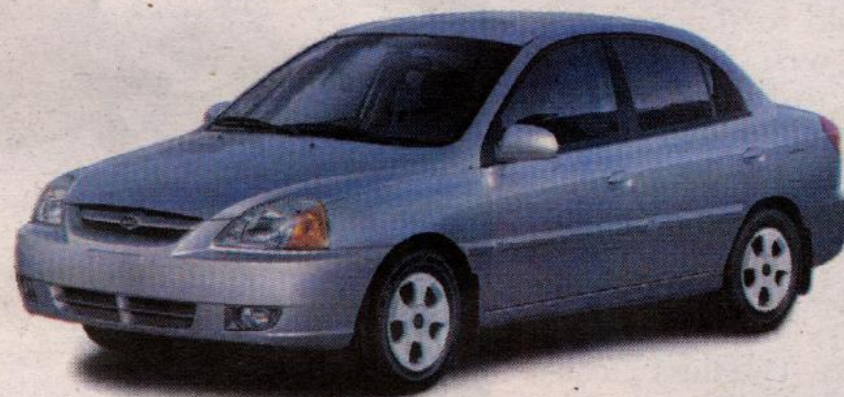
LS model shown 1