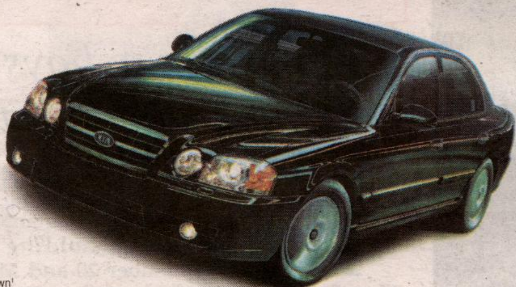
EX-V6 model shown 1