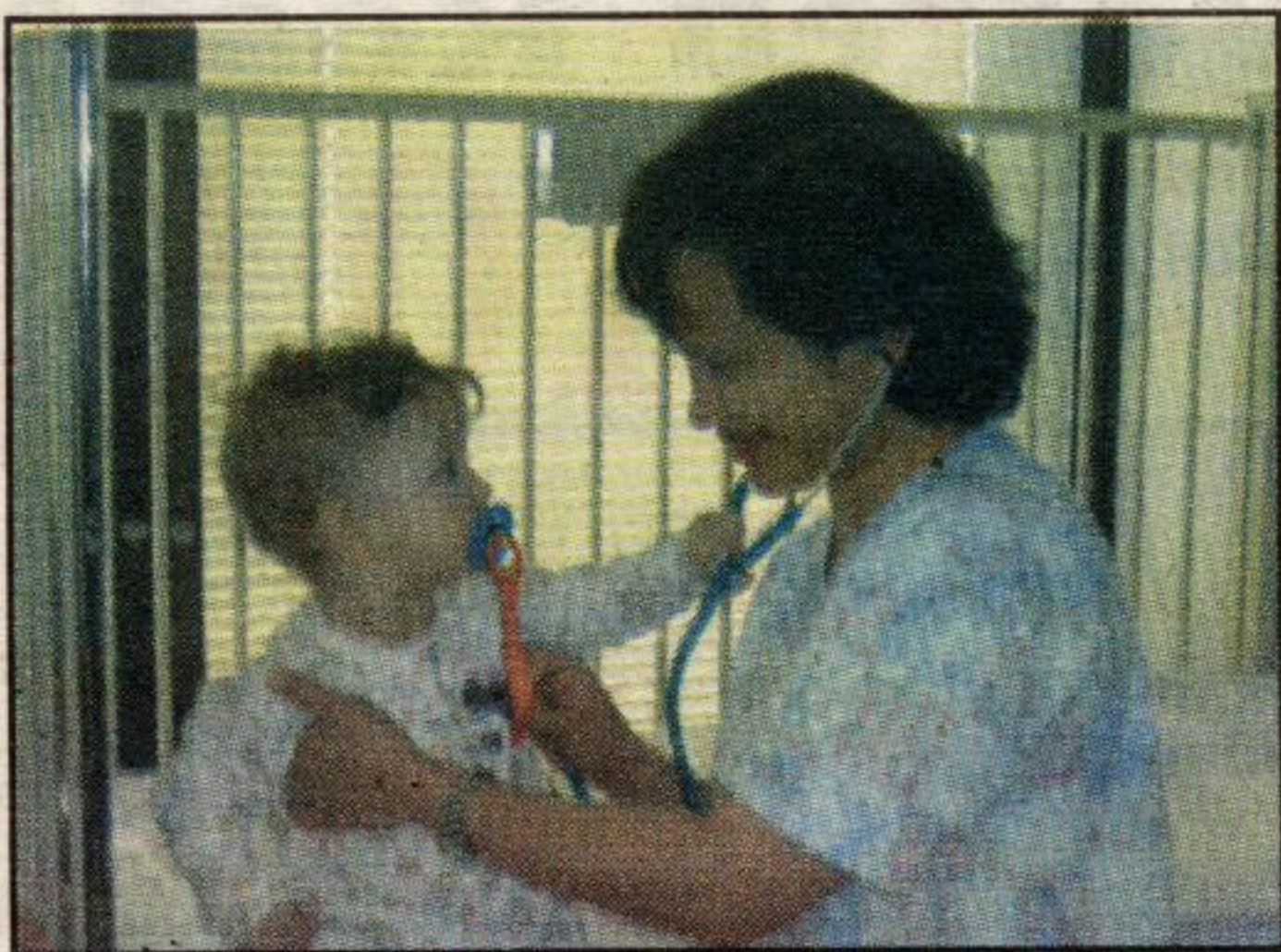
As a Regional Paediatric Centre, William Osler Health Centre offers a number of health care options to our youngest patients - from intensive care in our Level II and Advanced Level II Special Care Nurseries to inpatient and outpatient care.

Transferring or referring patients to these services at another hospital is a complex and often lengthy process. However, since Osler physicians based in Georgetown, Brampton and Etobicoke have privileges at all three campuses, patients can be admitted and referred between sites in a much more timely fashion.