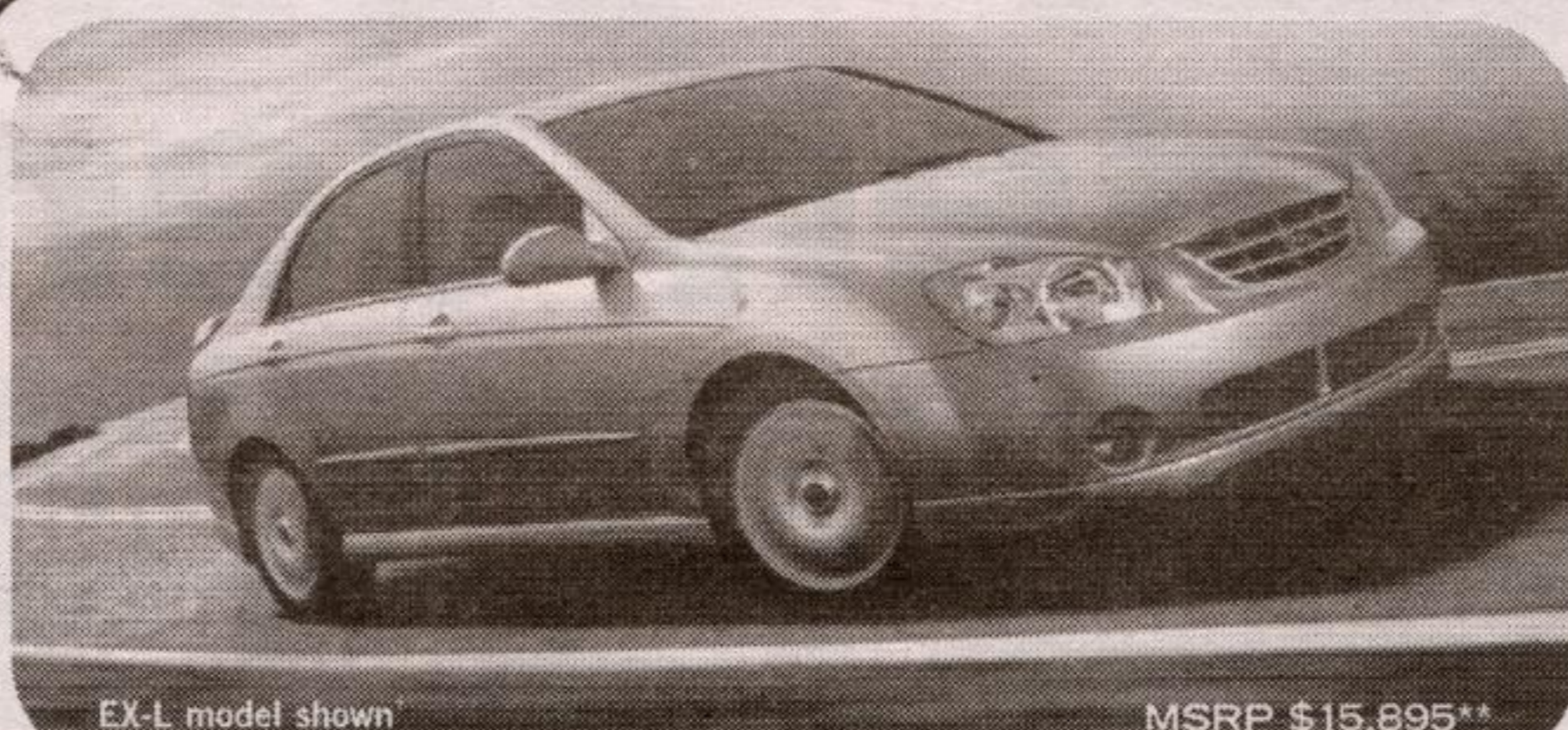
EX-L model shown MSRP $15,895**