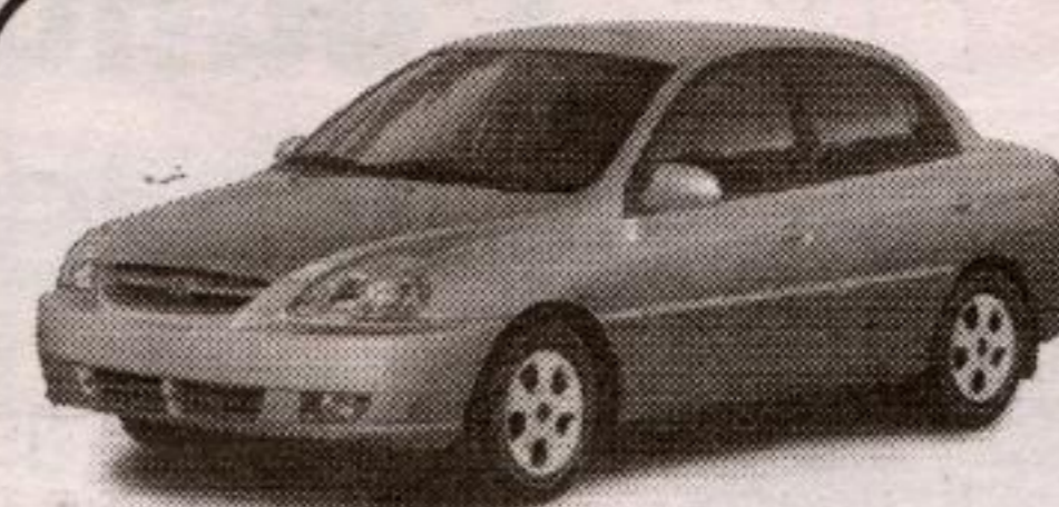
LS model shown MSRP $12,650**