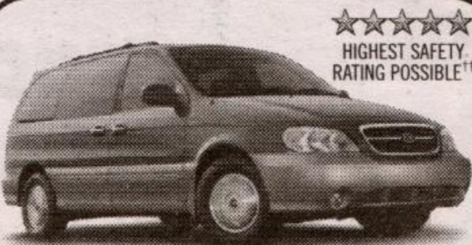
EX-L model shown MSRP $25,595**

$0 SECURITY DEPOSIT OR 0% PURCHASE FINANCING †