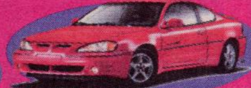
1998 GRAND AM