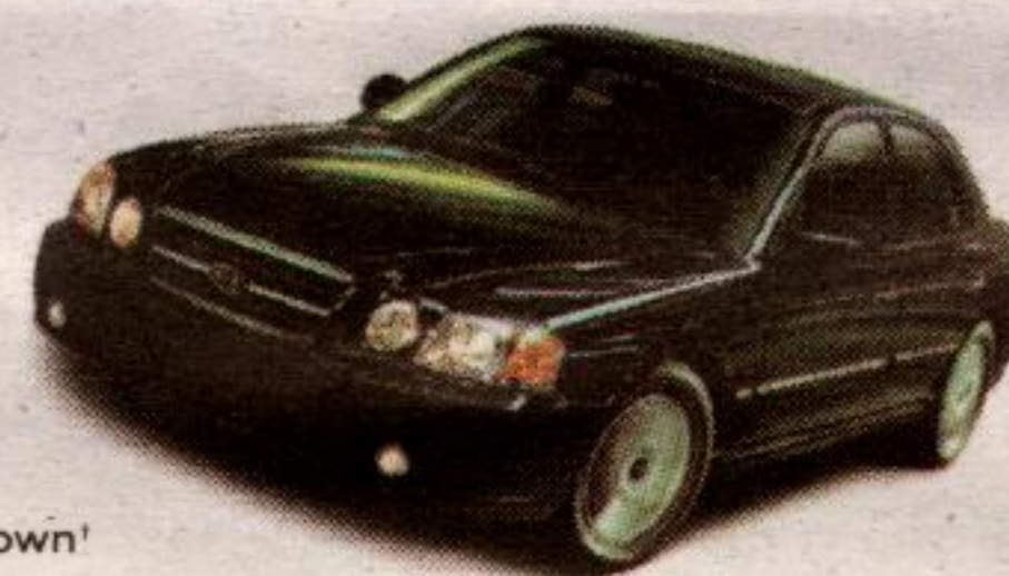
EX-V6 model shown 5

$199* LEASE FROM PER MO./60 MOS. $0 SECURITY DEPOSIT $4850 DOWN OR 0% PURCHASE FINANCING 3