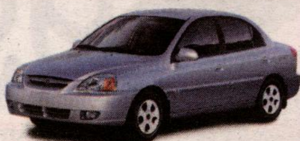
LS model shown 6

$205* LEASE FROM PER MO. 60 MOS. $0 SECURITY DEPOSIT $2995 DOWN OR 0% PURCHASE FINANCING FOR 60 MONTHS 3