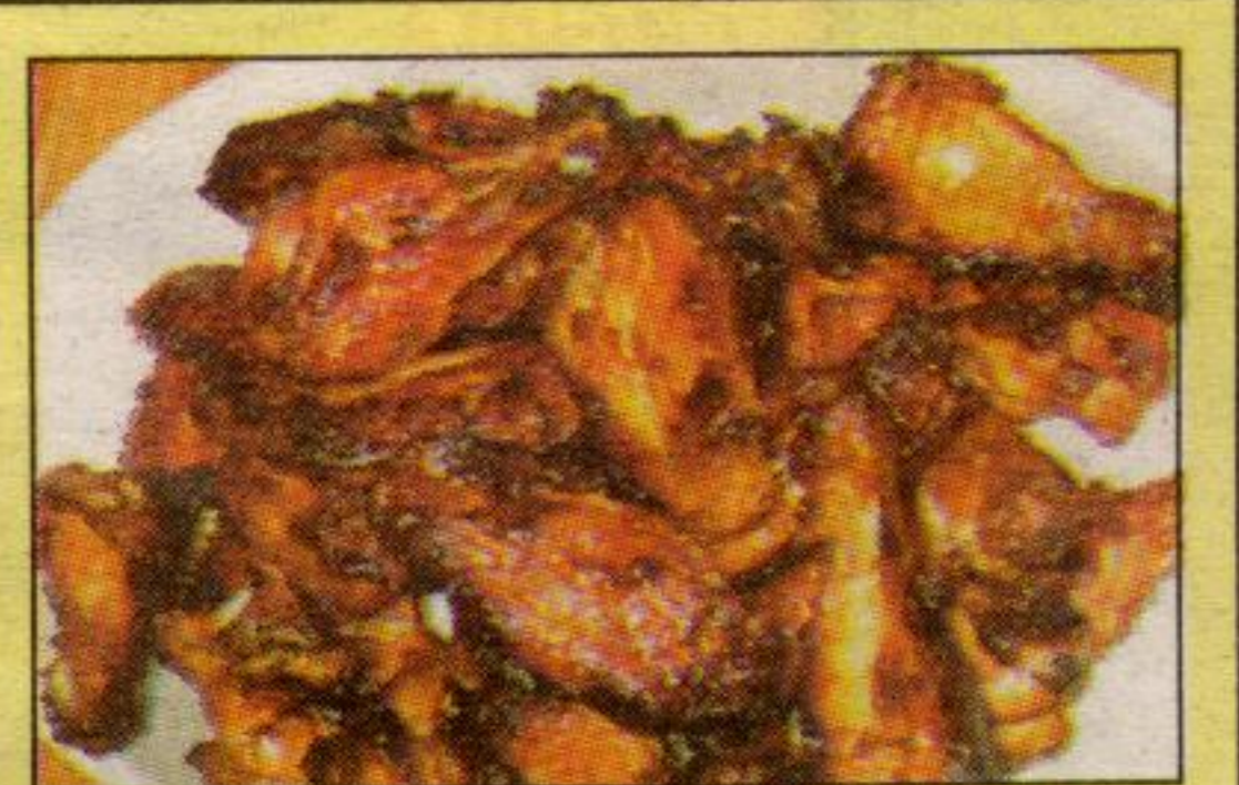
What's Cookin' pg. 30