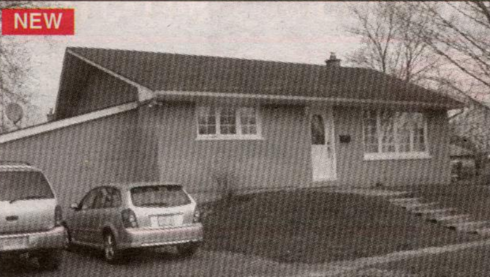
DETACHED BUNGALOW WITH SEPARATE INLAW SUITE

GO TO www.davekrause.com FEATURE HOME OF THE WEEK