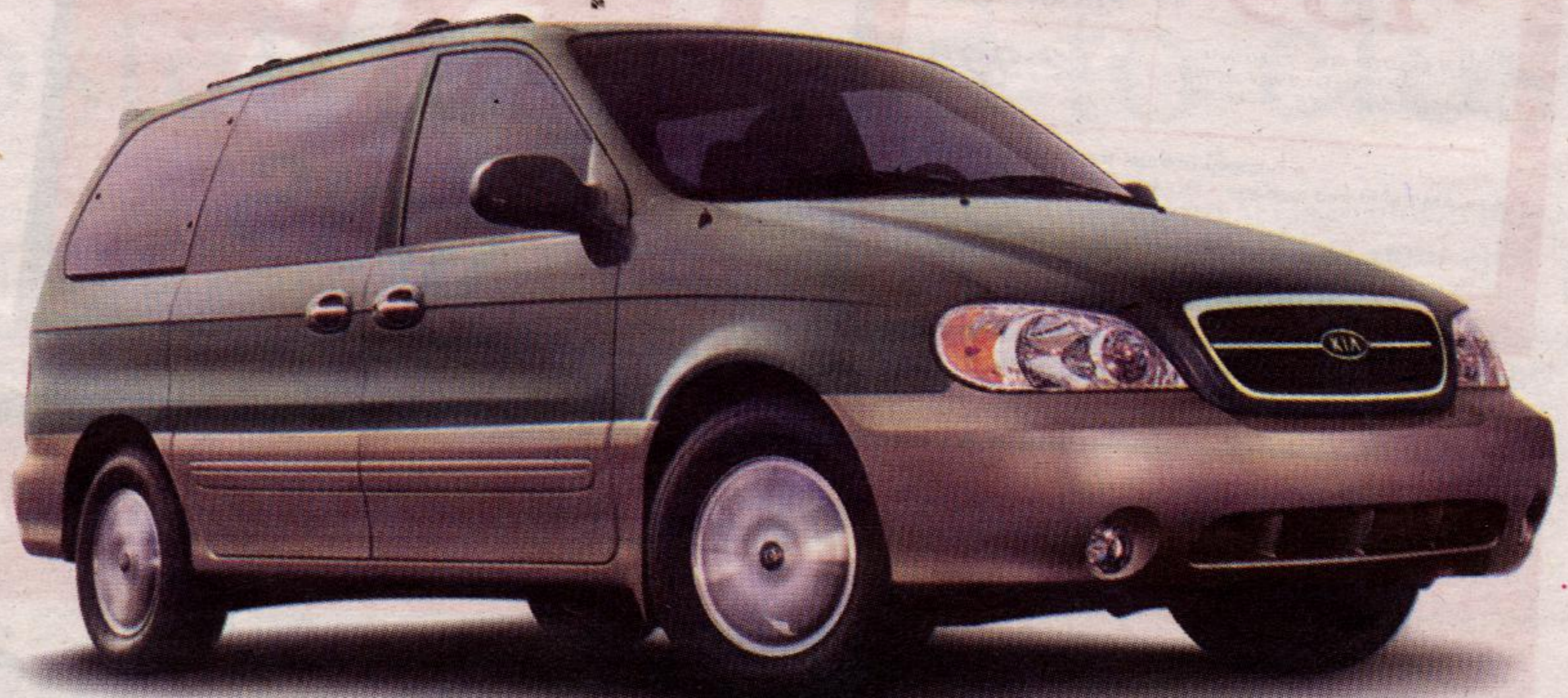
EX-L model shown 1