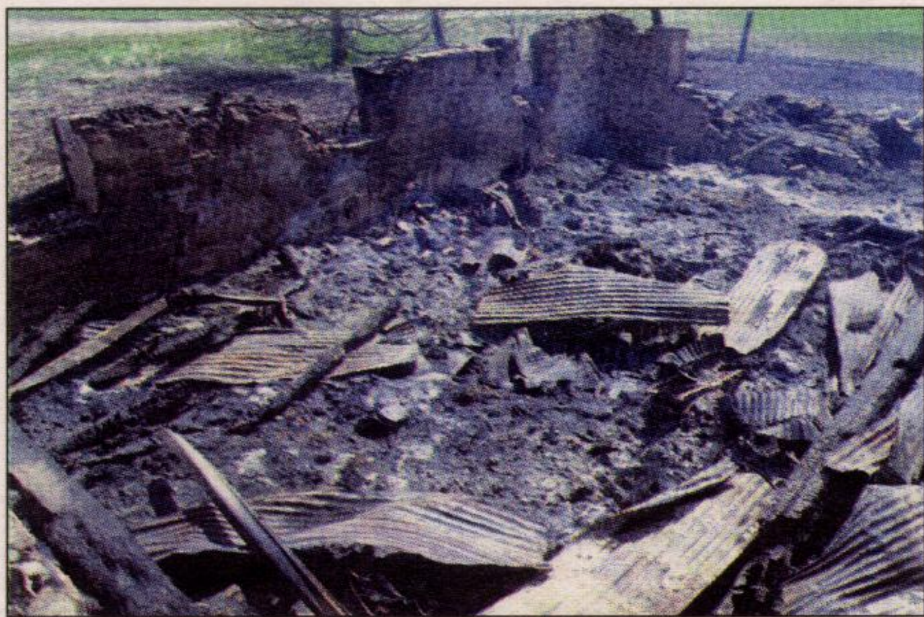
The remains of a barn on 17 Sideroad, west of Winston Churchill Blvd., were still smoldering Monday morning following a fire Halton Hills firefighters believe was deliberately set Saturday night.