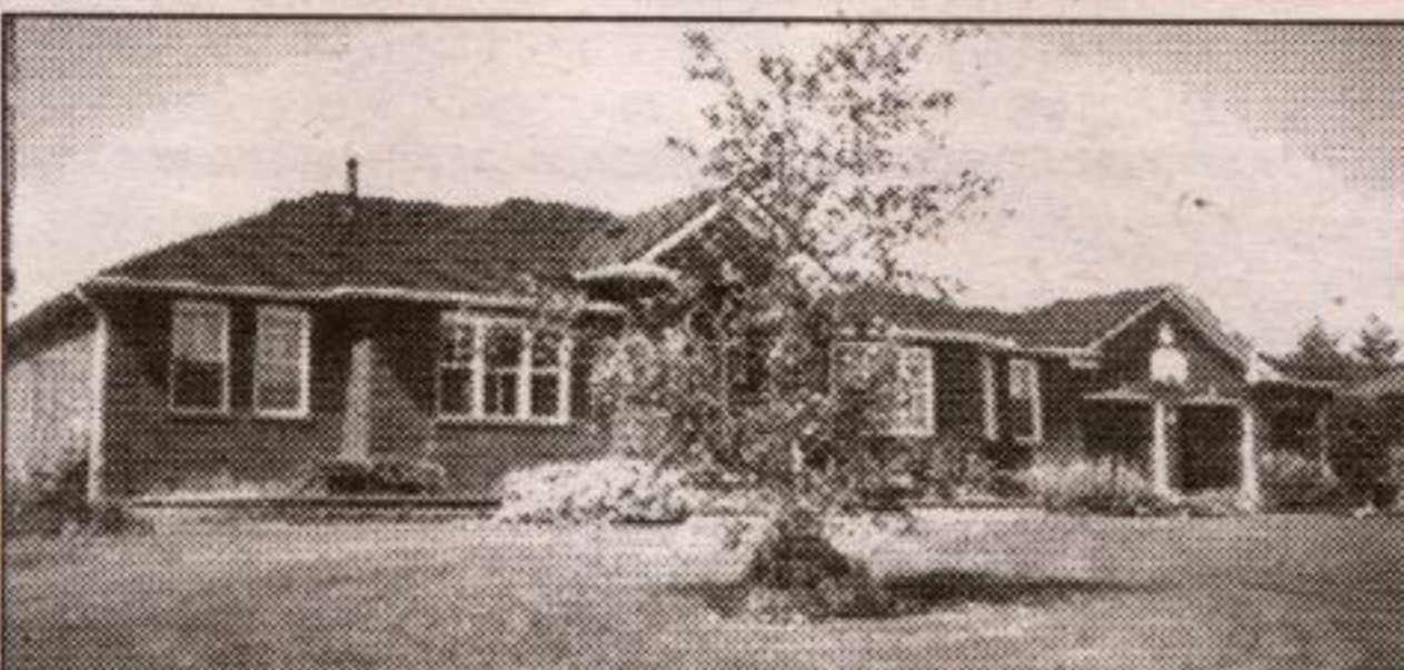
EXECUTIVE BRICK BUNGALOW IN PRESTIGIOUS ESTATE SUBDIVISION IN BELWOOD $379,900

Century home on large tree lot in town of Milton. Classic front porch, country kitchen, formal dining room with wood fireplace, hardwood floors. 10' ceilings, plaster construction, formal living room with bay window, 4 bedrooms, music/office. Detached 2 car garage, ample parking. Close to all amenities. Possible professional office. Please call L.A. re-zoning.