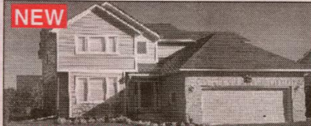
YOU CAN'T GET ANY BETTER THAN THIS!!! $329,900

The quality of this home has been substantially increased since its original construction. Spacious family home in Mill Run subdivision. Updated hardwood floors, windows & roof, doors, broadloom, hi-efficiency gas furnace, central air, central vac, skylight, driveway, garage, vinyl siding, fascias & soffits. 4 bedrooms, master bedroom with upgraded ensuite. Formal living-room & diningroom. Spacious family room open to second floor. 4 washrooms, main floor laundry. Landscaped lot. Immaculately cared for and maintained to perfection. 10+++ Michele*.