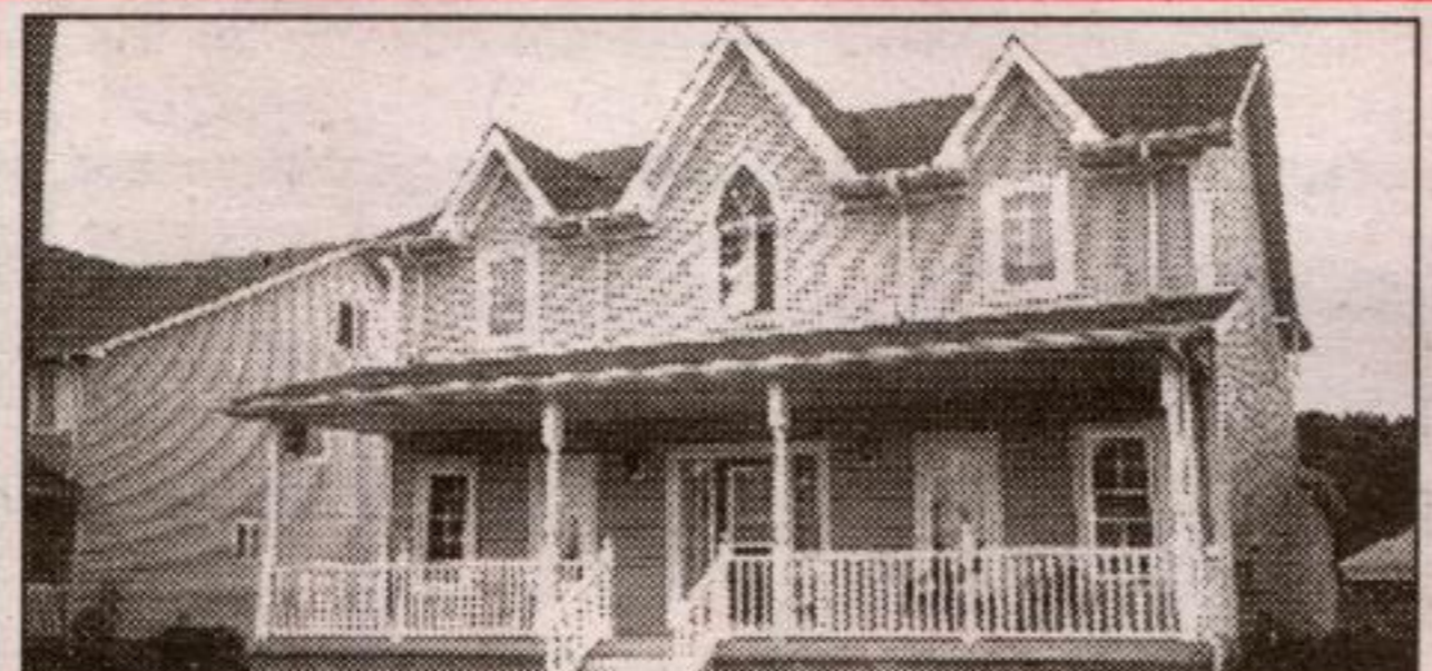
BEAUTIFUL FOUR BEDROOM HOME IN PRESTIGIOUS ROCKWOOD RIDGE $334,900

You've earned the right to enjoy the Best! Large foyer with ceramic flooring, spacious LR & DR, oak kit., with Centre Island & walkout to 16' X 23' deck. Main flr. FR with woodburning FP., main flr LR, Mst. Bdrm with 4 pc. ensuite & walk-in closet. Large bsm area with woodburning FP, extra bdrm & walkout to landscaped yard. .83 acres. 3 car garage. A Pleasure to Show! Gord* or Michele*.