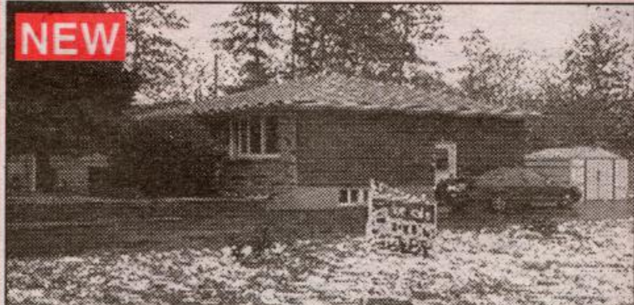
BRICK BUNGALOW ON LARGE TREET LOT IN ROCKWOOD $217,500

Bright, eat-in kitchen with walkout to 16' x 16' deck and landscaped backyard with pond. 3+3 bedrooms. Updated windows in '90. Lower level features 3 bedrooms, recreation room, kitchen or 4 pc wash-room. Inlaw potential with separate side entrance. Original owners. Close to conservation and school. Please call Michele*.