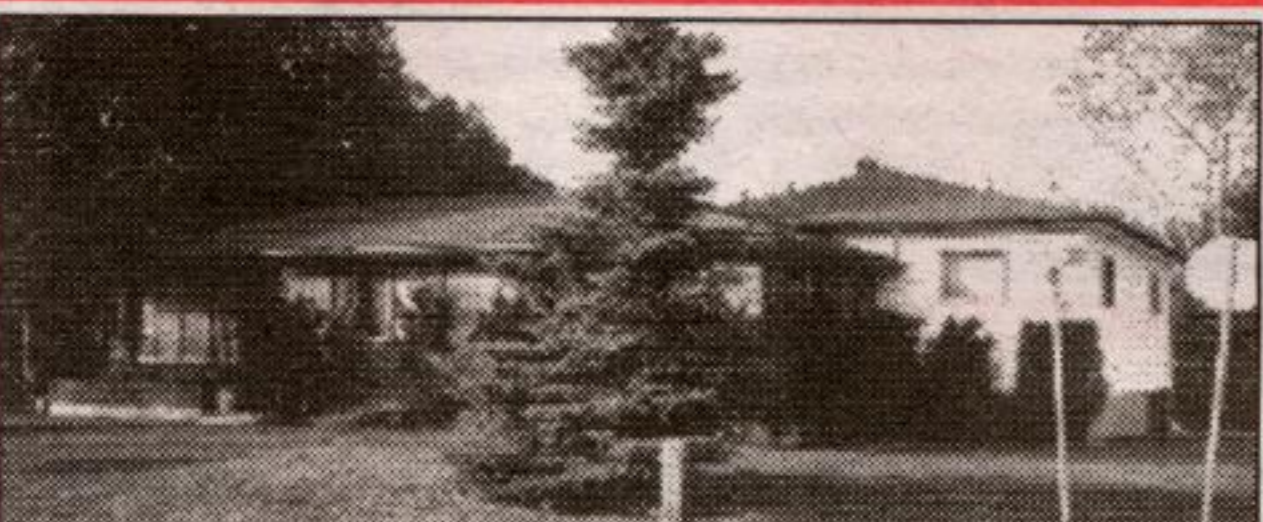
UPDATED HOME WITH COMMERCIAL ABILITY - ROCKWOOD - $204,900

4 bedroom home on 51' lot. Large foyer with ceramic floors, formal LR & DR with French doors. Eat-in kitchen with oak cabinets & breakfast bar & pantry, overlooking FR with gas FP, main flr. laundry & mudroom. Mstr. bdrm with ensuite with jacuzzi tub & walk-in closet. Full basement. 9' ceilings, central vac. Many upgrades. Just Like New! Gord* or Michele*.