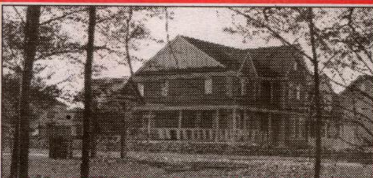
BEAUTIFULLY APPOINTED BRICK HOME IN PRESTIGIOUS ROCKWOOD RIDGE $345,000

Bright, eat-in kitchen with walkout to 16' x 16' deck and landscaped backyard with pond. 3+3 bedrooms. Updated windows in '90. Lower level features 3 bedrooms, recreation room, kitchen or 4 pc wash-room. Inlaw potential with separate side entrance. Original owners. Close to conservation and school. Please call Michele*.