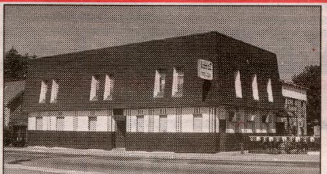
GREAT BUSINESS OPPORTUNITY

Walkout from living room to deck & patio, large eat-in kitchen with parquet flooring, stone fireplace with woodburning insert & office area. 3 bedrooms, master bedroom with walkout to deck, walk-in closet and 3 pc ensuite. Finished basement with walkout to garage. Not a drive by. Needs to be seen to be appreciated. Please call Gord* or Michele*.