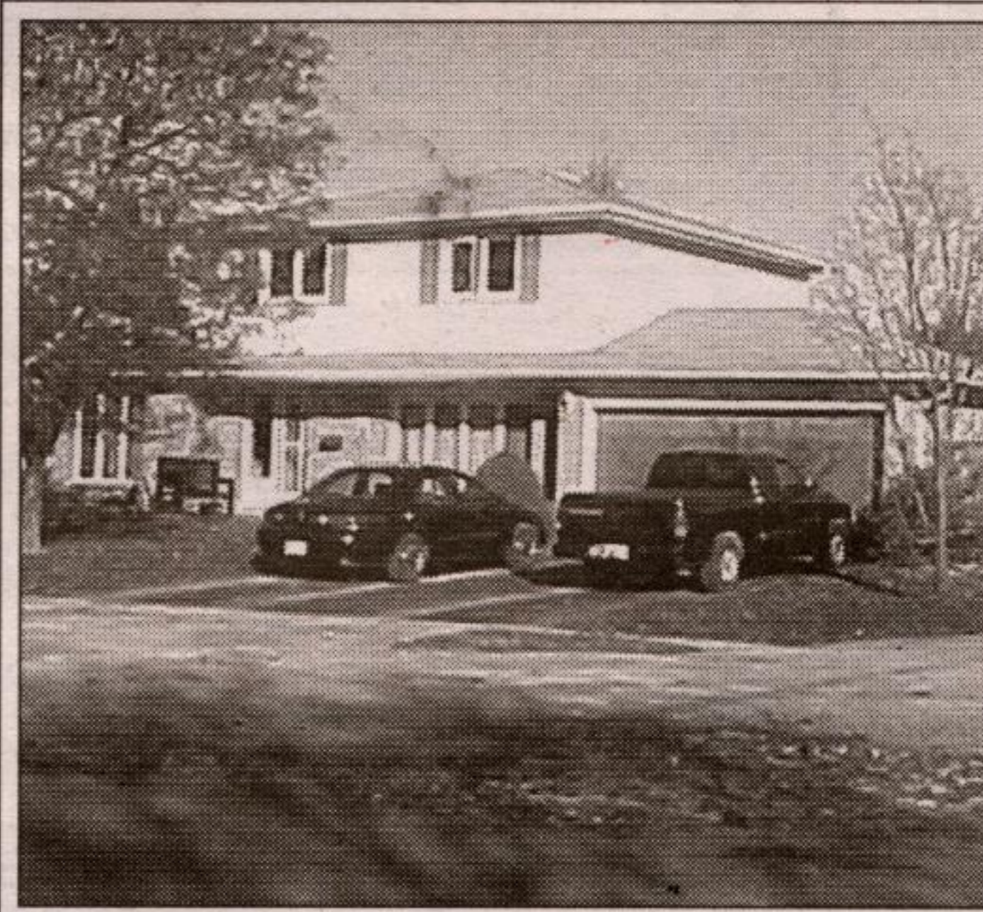
IN TOWN 100 FEET OF FRONTAGE

—Canadian Mortgage and Housing Corporation