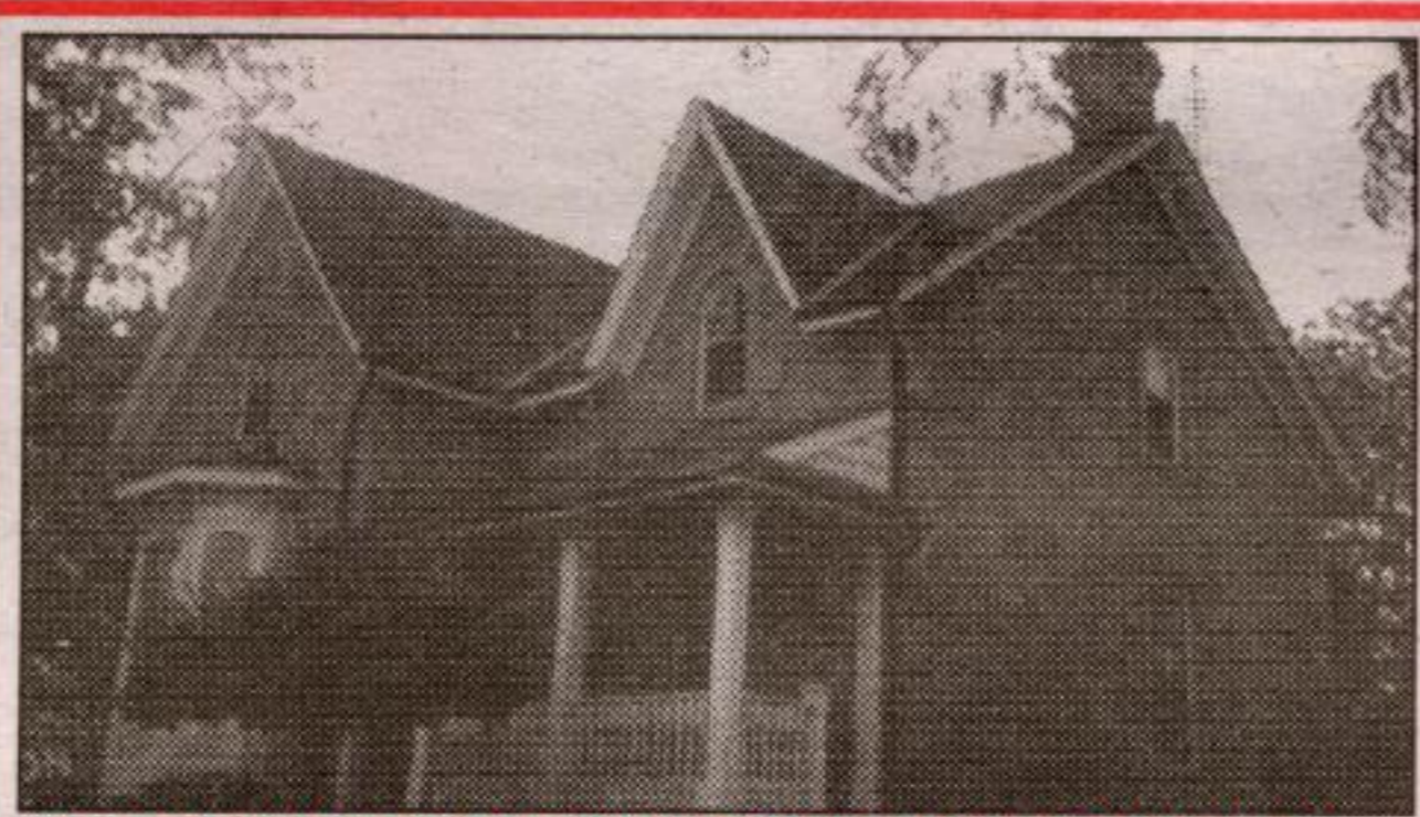
1880 MAJESTIC STONE HOME IN MILTON BUSINESS/OFFICE POTENTIAL - $399,900

Wrap-around porch. Bright, spacious, open concept kitchen, breakfast area & great room featuring gas fireplace & crown moulding, walkout from kitchen to patio. Separate dining room with hardwood floors, crown moulding & extra windows overlooking parkland. Main floor laundry. Den/office with crown moulding. Large master bedroom with 2 walk-in closets & 4 pc. ensuite. Central air. Detached double car garage. Landscaped lot with stone wall, cedar hedge & stone walkway. Please call Gord* or Michele*.