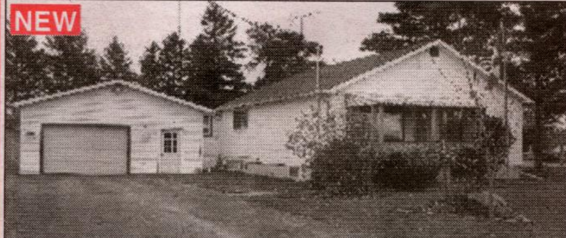
COUNTRY BUNGALOW MINUTES TO GUELPH $218,900

Large country eat-in kitchen. Separate dining room. Spacious living room with gas fireplace, built-in bar & picture window overlooking fenced backyard. Main floor laundry. Attached workshop/garage with gas heater, workbench, 10' ceiling height, 220 amp service and walkout to back yard. Walkout from mud room to 24' x 16' wood deck. Recreation room & office.