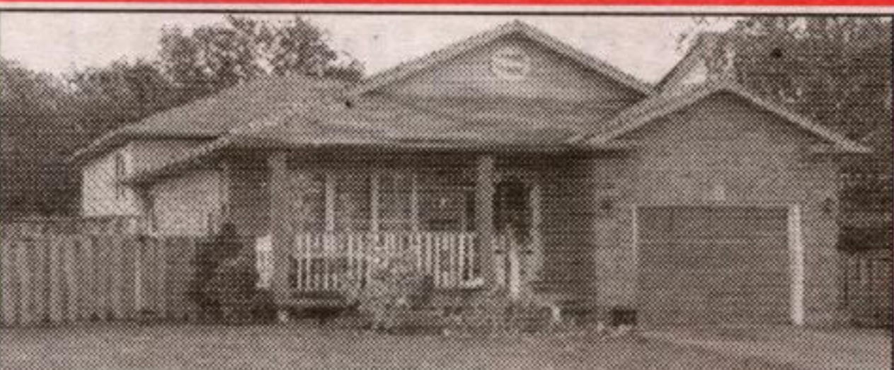
GREAT FAMILY BACKSPLIT IN VILLAGE OF ROCKWOOD $238,900

Land mark hotel, 17 rooms, dining room, large lounge, patio, room for expansion, near the Olde Hide House. Very reasonable price. Excellent business for growth.