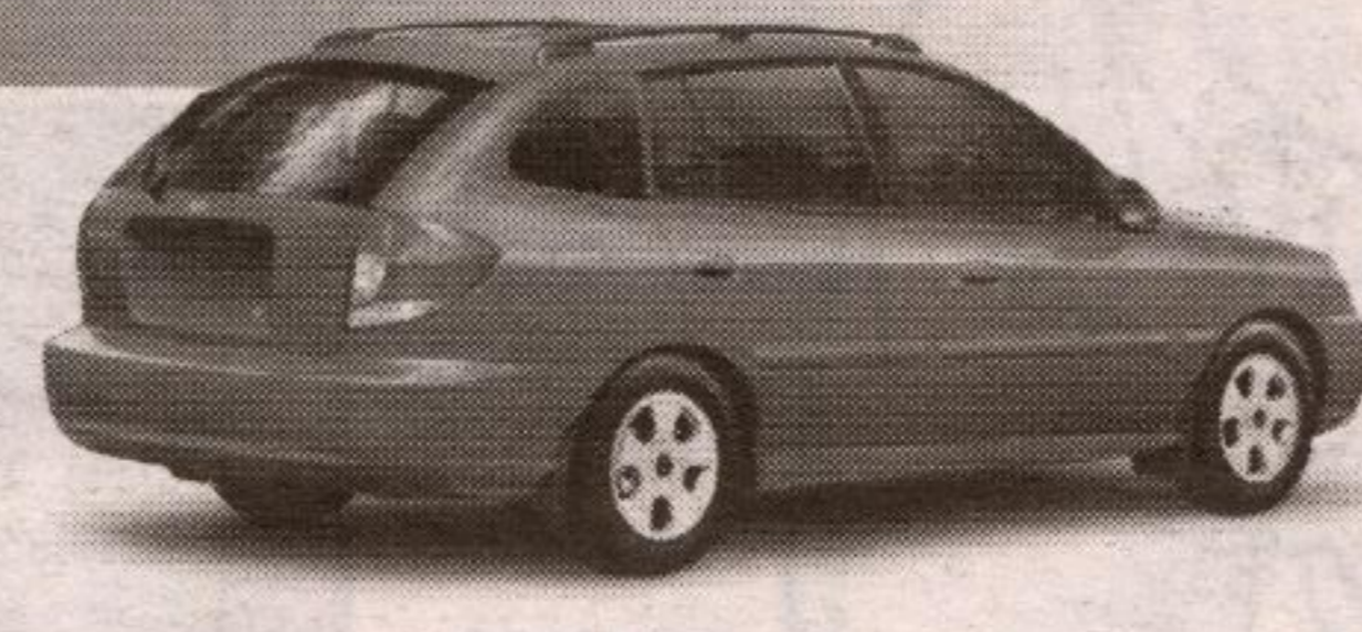
RX-V Convenience model shown*

Only $2,100 Down Payment $0 SECURITY DEPOSIT OR 0% PURCHASE FINANCING FOR 60 MONTHS PLUS NO PAYMENT FOR 90 DAYS