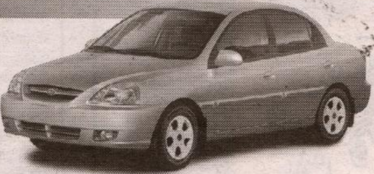
LS model shown*

Only $1,695 Down Payment $0 SECURITY DEPOSIT OR 0% PURCHASE FINANCING FOR 60 MONTHS PLUS NO PAYMENT FOR 90 DAYS