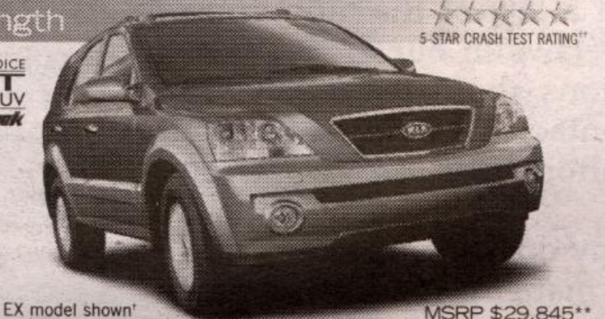
EX model shown*

Only $4,750 Down Payment $0 SECURITY DEPOSIT OR 0% PURCHASE FINANCING