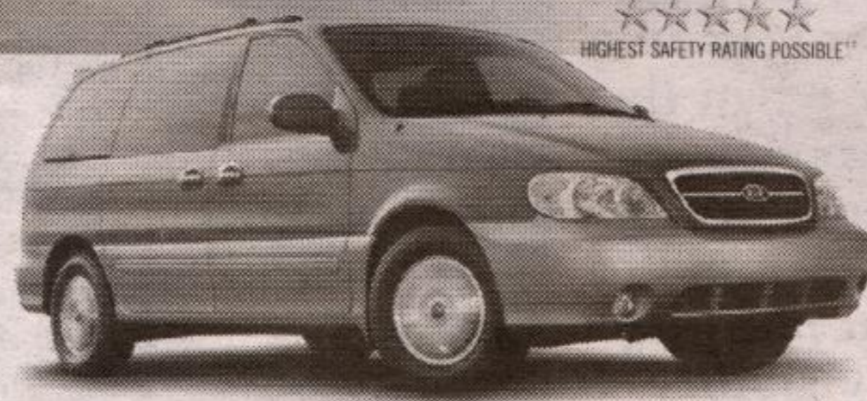
EX-L model shown*

Only $4,850 Down Payment $0 SECURITY DEPOSIT OR 0% PURCHASE FINANCING PLUS NO PAYMENT FOR 90 DAYS