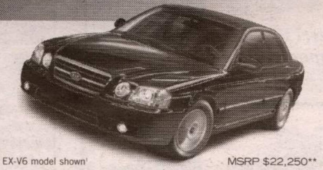
EX-V6 model shown*

Only $2,250 Down Payment $0 SECURITY DEPOSIT OR 0% PURCHASE FINANCING PLUS NO PAYMENT FOR 90 DAYS