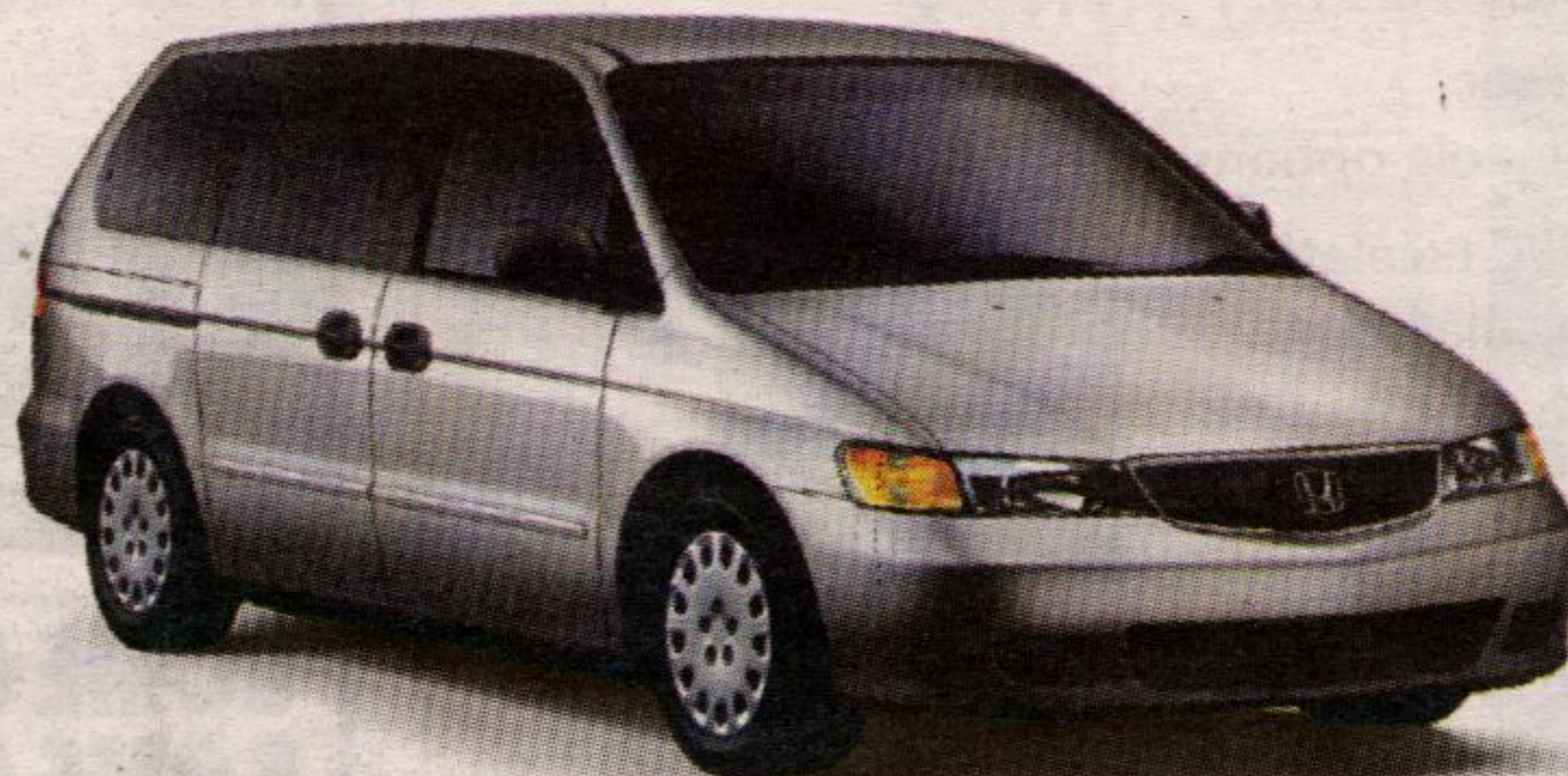
2003 Honda Odyssey

3.8%** purchase financing for 60 months is available too.