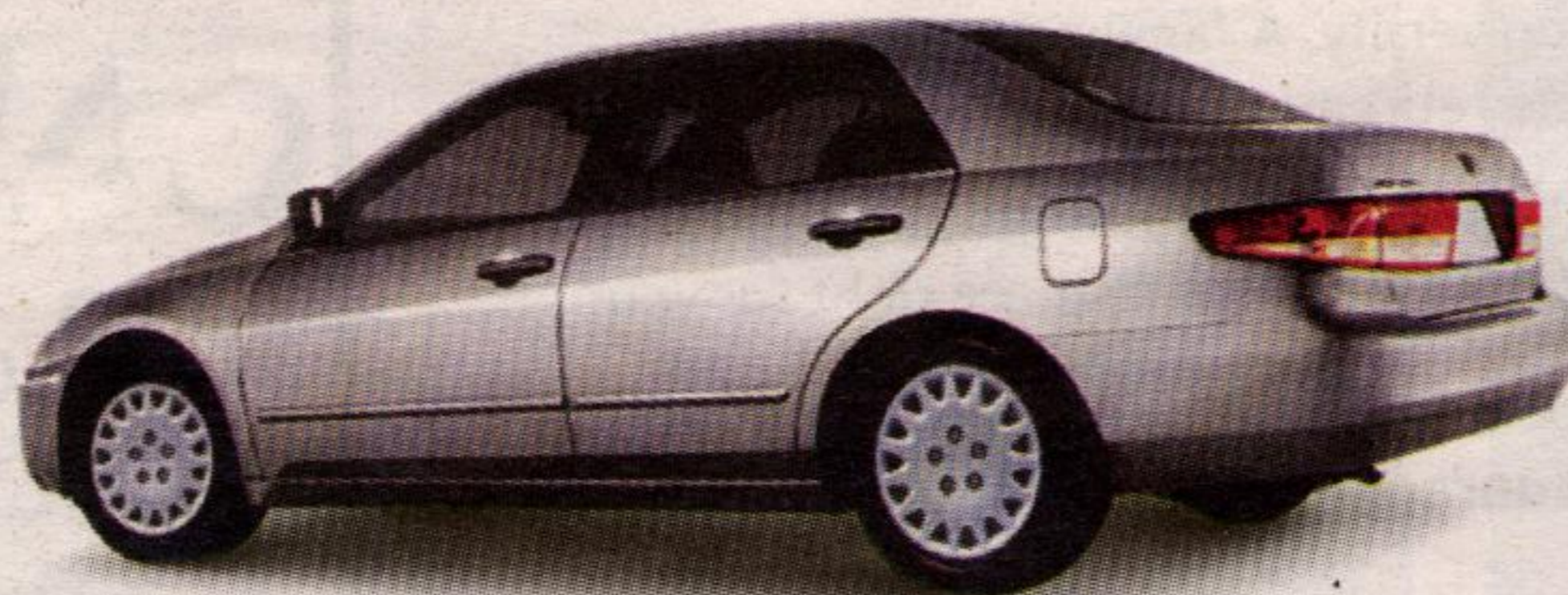
2003 Honda Accord Sedan