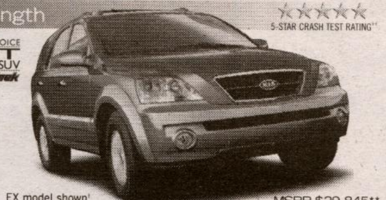
EX model shown 1