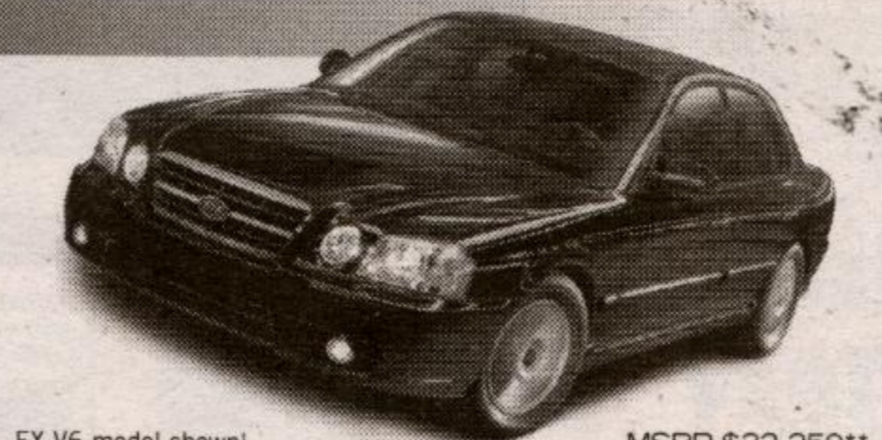
EX-V6 model shown 1

OR 0% PURCHASE FINANCING PLUS NO PAYMENT FOR 90 DAYS