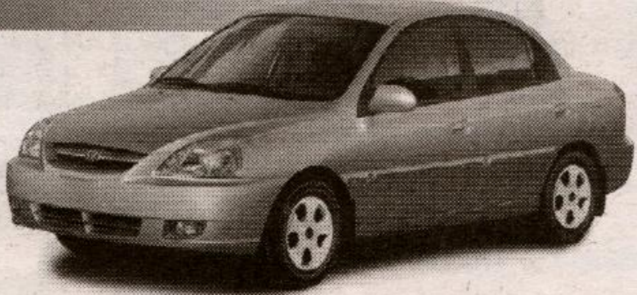
LS model shown 1

OR 0% PURCHASE FINANCING FOR 60 MONTHS PLUS NO PAYMENT FOR 90 DAYS