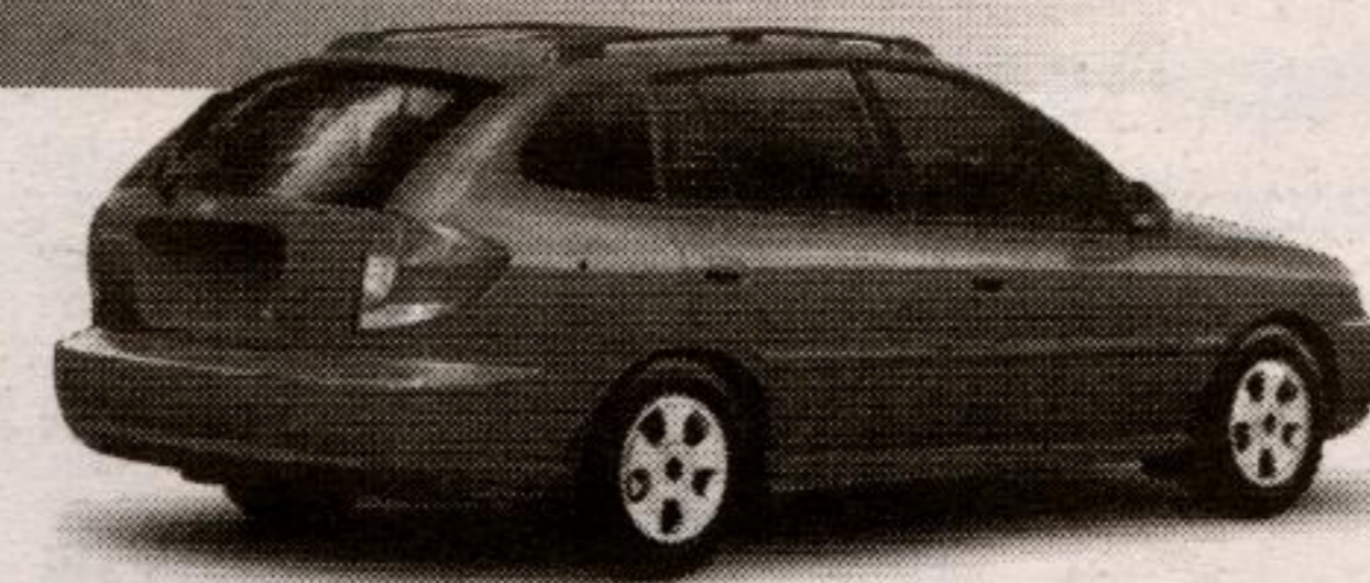
RX-V Convenience model shown 1

OR 0% PURCHASE FINANCING FOR 60 MONTHS PLUS NO PAYMENT FOR 90 DAYS