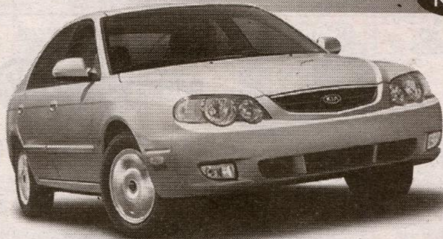
GSX model shown 1

DON'T PAY FOR 12 MONTHS 1 OR 0% PURCHASE FINANCING 2 PLUS NO PAYMENT FOR 90 DAYS 3 on Selected Models