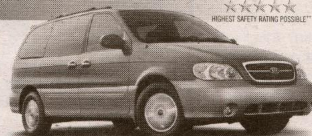
EX-L model shown 1

OR 0% PURCHASE FINANCING PLUS NO PAYMENT FOR 90 DAYS