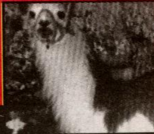
"ROMEO" THE LLAMA