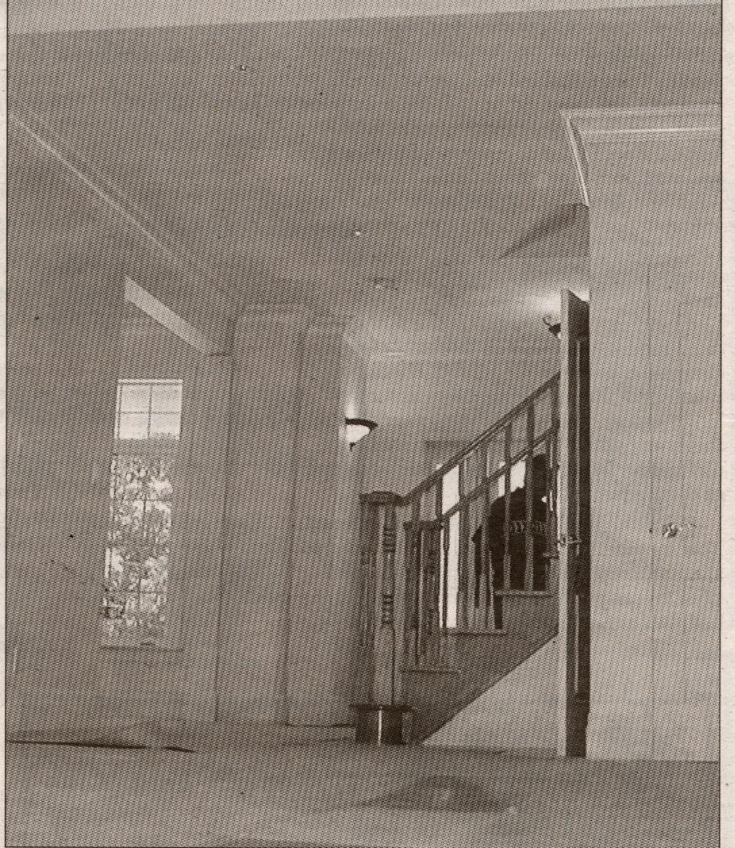
Mississauga high school students helped build this Norval home with the help of trade professionals. It was the first project of the Educational Construction Ltd. designed to introduce and train students in the building trades.