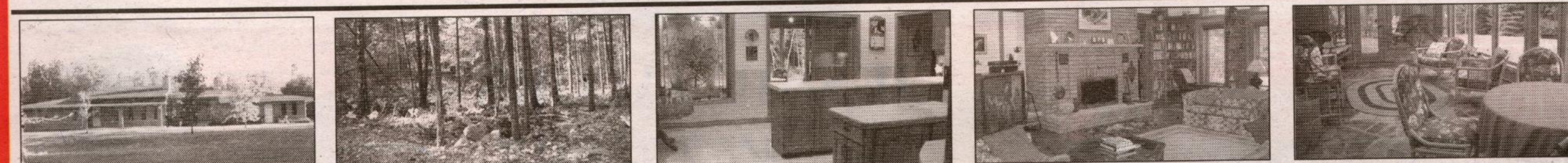
DESIGNED FOR LUXURY RETIREMENT LIVING. Wonderful custom bungalow built by "Arnie Miller" with attention to detail. Huge country kitchen walking out to 3 season sunroom and adjoining screened-in room. Large family room with floor-to-ceiling brick fireplace, separate office, spa room with hot tub, 3 bedrooms plus huge garage and extra storage area, all on 12 acres. No expense spared!! $599,000. Martha Summers*