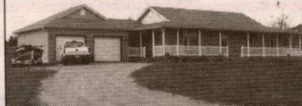
OPEN CONCEPT BUNGALOW $299,000. Fabulous large cherry kitchen open to living & dining area. Walkout to rear deck. 3 bedrooms, full ensuite & walk-in closet in mstr bdrm. High ceilings, all brick, over-sized 2 car garage on large lot in estate subdivision. Walk to town & arena. Martha Summers*