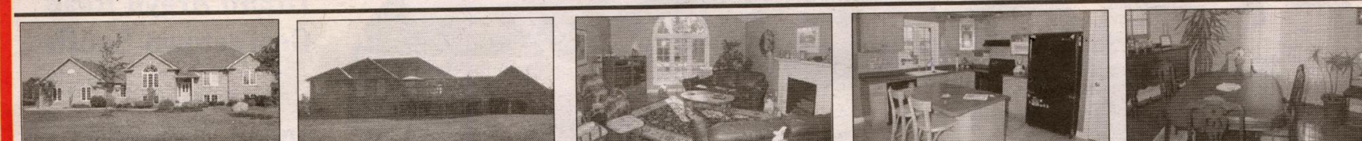
CHARLESTON QUALITY - $399,000. Superb raised bungalow, stunning great room with cathedral ceiling & hardwood floor & propane fireplace. Wonderful kitchen, walking out to large multi-level deck.. Enjoy professional landscaping. Very special. Martha Summers*