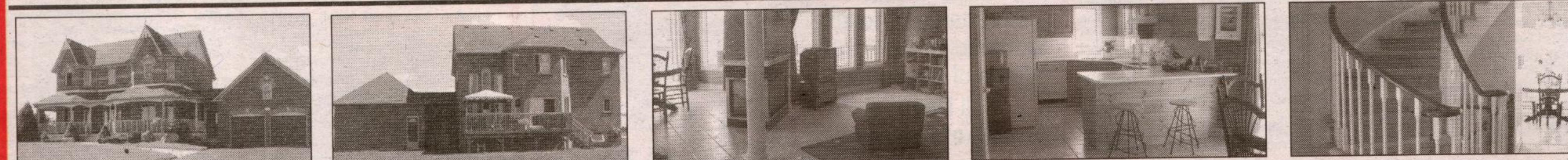
ALMOST NEW VICTORIAN FLAIR. Approx. 2800 sq. ft. of quality in smaller estate subdivision on edge of Village of Erin. Family rm with 2 storey height, double sided gas fireplace, spacious sun-filled eat-in kitchen with pine cabinets, bay windows, upgraded broadloom and trim, main flr. office, windows above grade in partially finished lower level. 4 bdrms complete with heated towel bar in master ensuite. You will love it!! $439,000. Martha Summers*