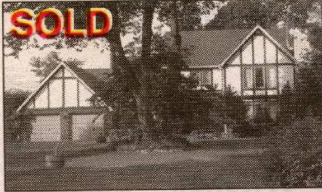
12929 Silvercreek, Halton Hills