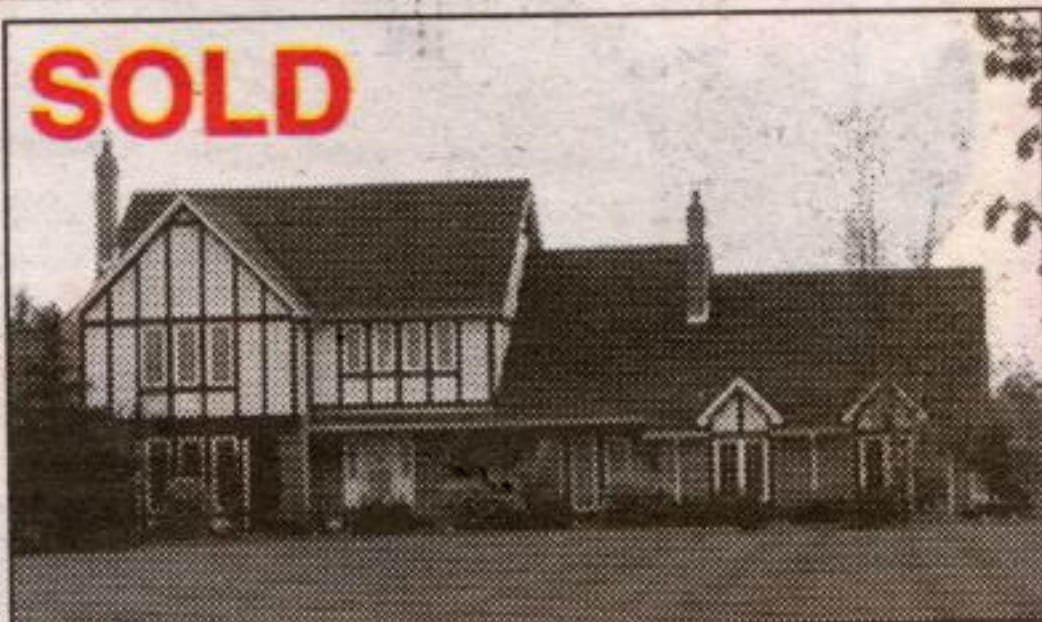
8 Blue Mountain, Halton Hills