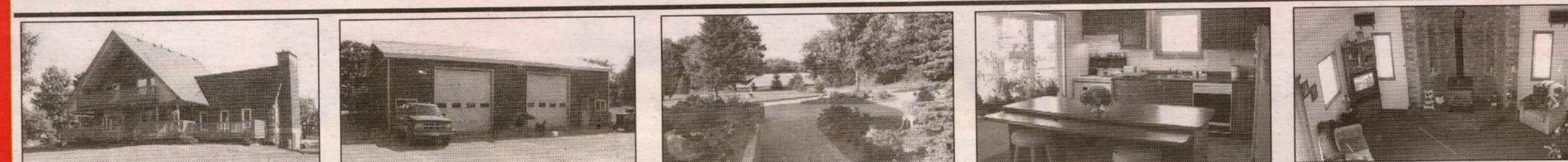
LOOKING FOR THAT PERFECT SHOP??? And a perfect home - it's here. 2.75 acres, recent open concept home with great room, inlaw suite, wrap-around verandah, huge oak kitchen and loft, master bedroom with walkout to a private balcony. The shop has oversized doors, heat, hydro and water, mezzanine and office area. Minutes north of Erin in rural setting. $529,000. Martha Summers*