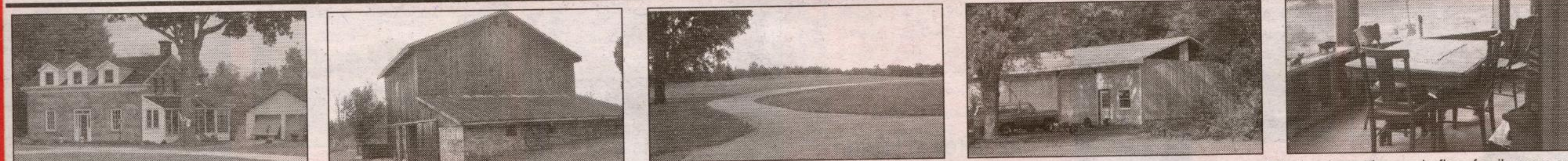
CLASSIC STONE FARMHOUSE - 40 ACRES. All the original charm and character here - well set back with mature hardwood to the north, open fields to the south and west. 3 bdrms, original wainscotting, main floor family room and sun room. Inground pool, separate implement building, small barn with water and hydro suitable for horses. One of a Kind. $950,000.