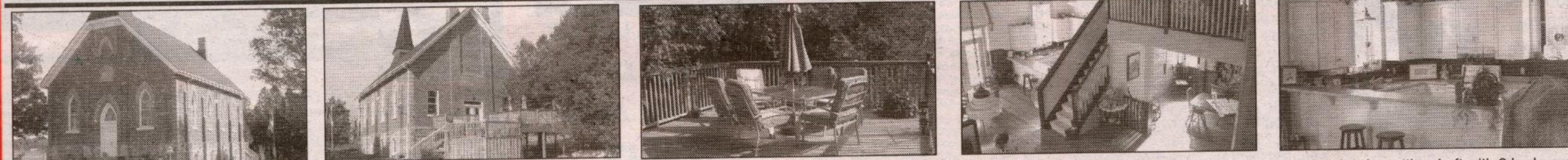
QUALITY CONVERSION - INCREDIBLE HOME. Perfect home or home office with lower level all above grade, separate entrance and sun-filled. Amazing main level, original wood floors, windows and wainscotting. Loft with 2 bedrooms and sitting area and semi-ensuite bathroom plus main level bedroom and bath. All mechanicals have been updated, on a paved road 1 hour to Toronto. Done to perfection!! $364,000. Martha Summers*