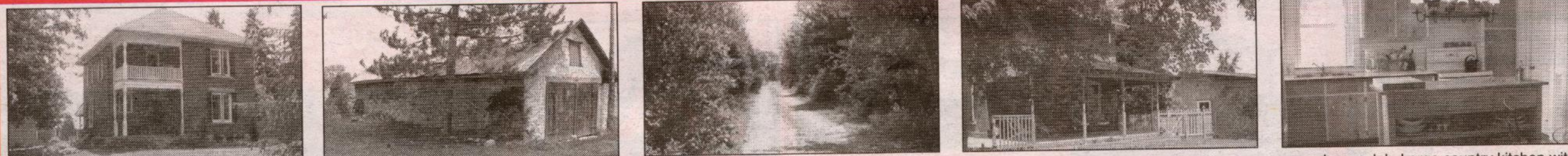
CHARACTER + CONVENIENCE - 3 ACRES. Nestled down a long driveway with pretty country views. Spacious 4 bdrm, 2 baths, main floor family room with woodstove and walkout to a wrap-around verandah. Large country kitchen with original wood floors, tin wainscotting in dining room and sun-filled living rm. Separate 4 bay garage, small stone workshop and water garden. Windows replaced. Vendor says "Let's sell!!". $379,000. Martha Summers*