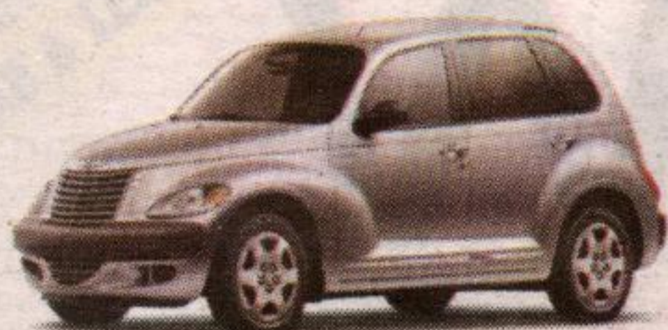
2003 PT Cruiser