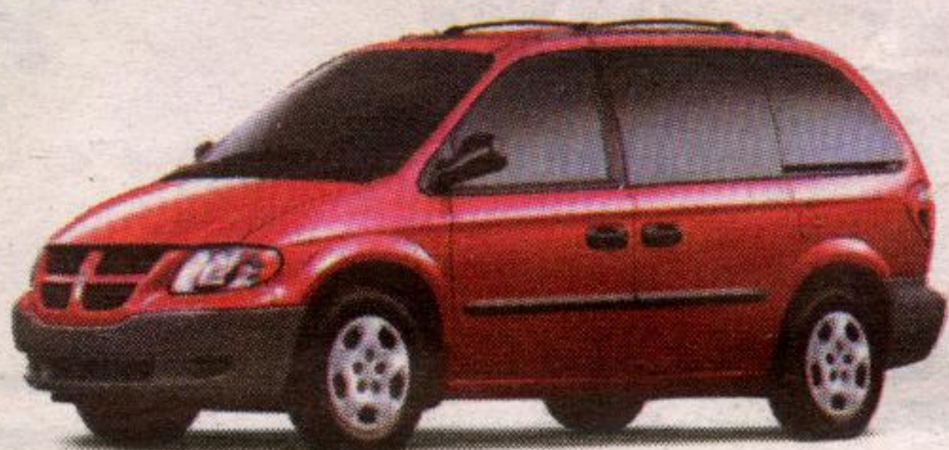
2003 Dodge Caravan SE

0% Purchase financing* for 72 MONTHS on all 2003 Dodge Caravan and Grand Caravan models.