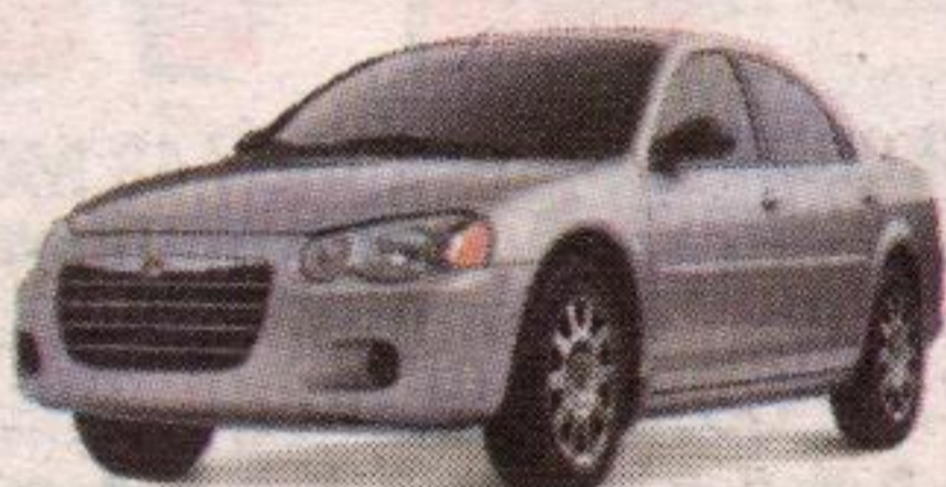
2004 Chrysler Sebring Sedan LX