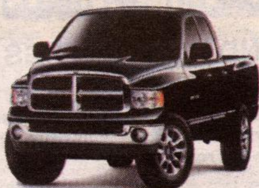
2004 Dodge Ram 1500

OR LEASE FOR $248* /month for 48 MONTHS with $4,085 down payment or equivalent trade. Plus $895 freight. NO SECURITY DEPOSIT.